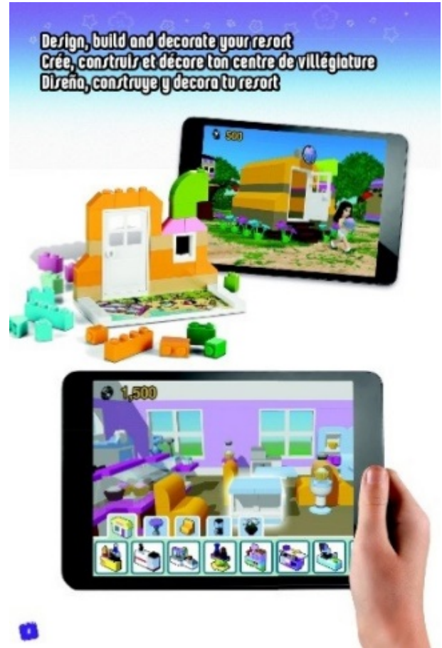
Figure 2. Instructions for Friends’ LEGO Fusion Resort Designer [10].

In the LEGO Friends Fusion Resort Designer children build a flat 2-dimensional building facade on a small plate. The structure is a maximum of 12 x 16 bricks. Next, children download and install the LEGO Fusion Resort App on a cell phone or tablet where they can customize their design, avatars, and take pictures of the structure.