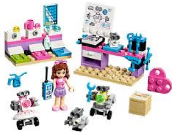
Figure 4: LEGO Friends- Olivia’s Creative Lab [12].

This set is Olivia’s small lab for building three robots. It includes a workbench, tools, a parts box, schematic, three robots and a charging station for the robots complete with monitor. The Olivia character is described on the LEGO Friends wiki as “a little shy, but is very sweet and is also smart and creative. She loves science, especially geology, and technology, and enjoys doing experiments and inventing” [12]. Here you are invited to help Olivia follow the schematic and build a robot family, and then recharge, repair and rebuild it.