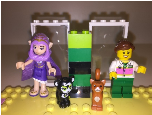
Figure 1. LEGO minidoll (left) and minifigure (right). Note shape and scale differences between the two in relation to the middle brick tower, door height and pet cats.

Thus, we chose to focus on femininely gender LEGO sets. The three LEGO sets selected for this analysis are identifiable as ‘girly’ by the design decision to replace standard LEGO minifigures with LEGO “minidolls” [16]. A minidoll is less square than the standard minifigure with noticeable curves at the hip and bust. The hands and hair are on the same scale, but the head, torso and legs are not compatible size wise between the two figure types. Further, the minidolls are 5 bricks tall as opposed to the minifigures at approximately 4 bricks. This means the scale of the furniture, accessories and buildings are different which relegates minidolls and minifigures to separate worlds.