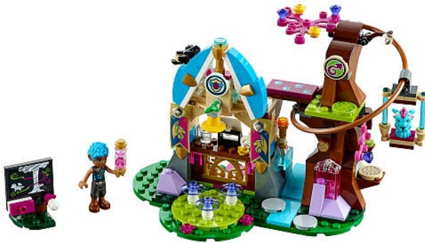
Figure 3: LEGO Elves Elvendale School of Dragons [11].

The LEGO Elves Elvendale School of Dragons is a school where Tidus, the dragon schoolteacher, teaches baby dragons how to fly. Notably unlike the Friends line a feature character, Tidus, is male. The set consists of a classroom replete with blackboard, lectern and mushroom stools for the dragons to use while listening to flying lectures. In a constructivist fashion the dragons are also encouraged to learn by doing, using a zip line mechanism which helps give them gather momentum, assisted by a breaking device. Finally, the baby dragon can be motivated to fly with a crossbow that shoots cookies.