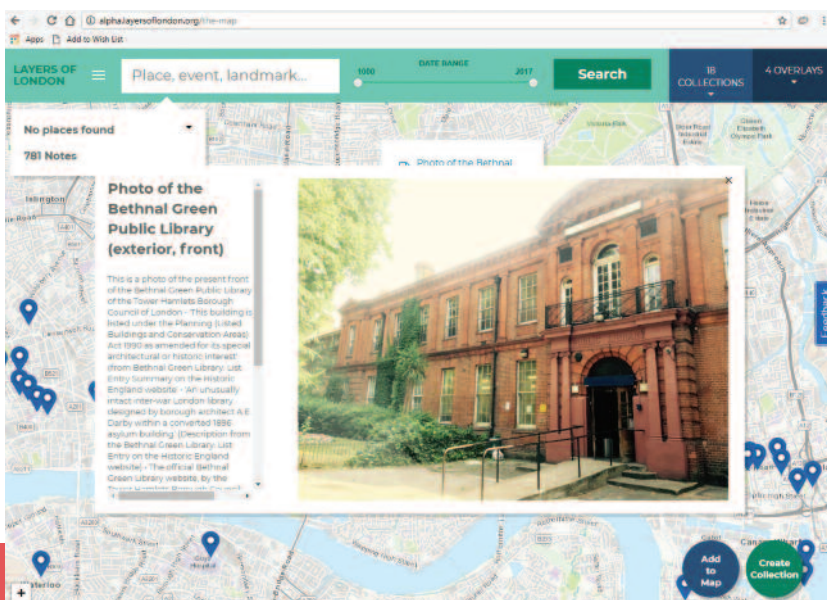
Figure 2: Information on Bethnal Green Library on the Layers of London website: data contributed by Tower Hamlets Council and Historic England.

of geographical data and to Doreen Massey's (2008) thought-provoking question 'whose geography?'.