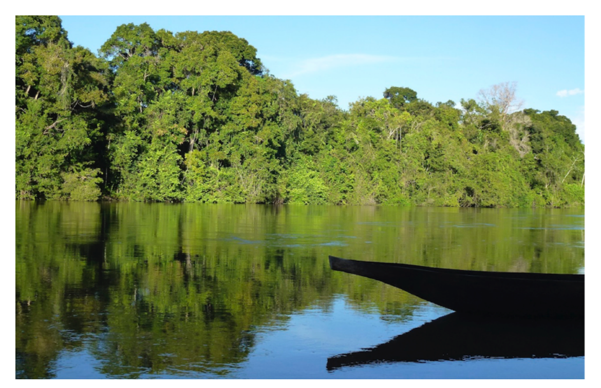
A view from the Rewa River | Rewa, 2013