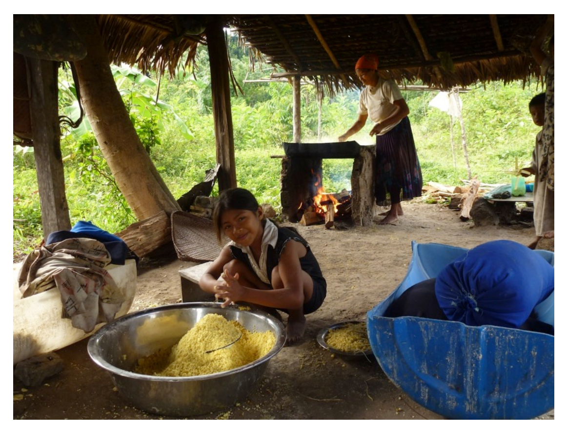
A Makushi family processing cassava | Rewa, 2013.<sup>2</sup>

• Keywords: Makushi, Guyana, Amazonia, bitter cassava, plants, agriculture, animism