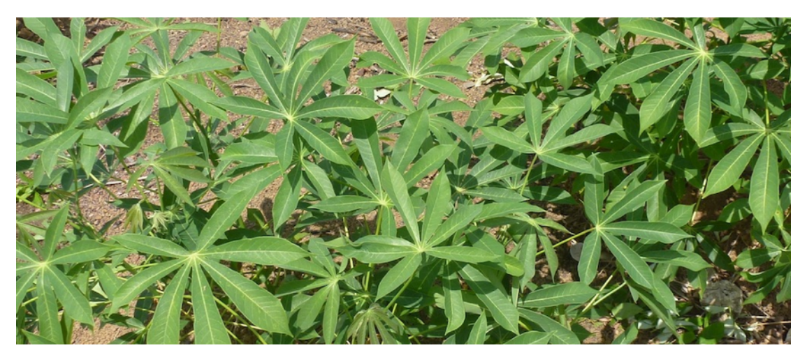
Cassava plants | Yupukari, 2012