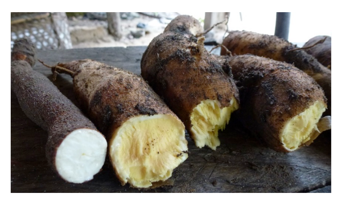
Cassava roots (kîse imun) | Rewa, 2013