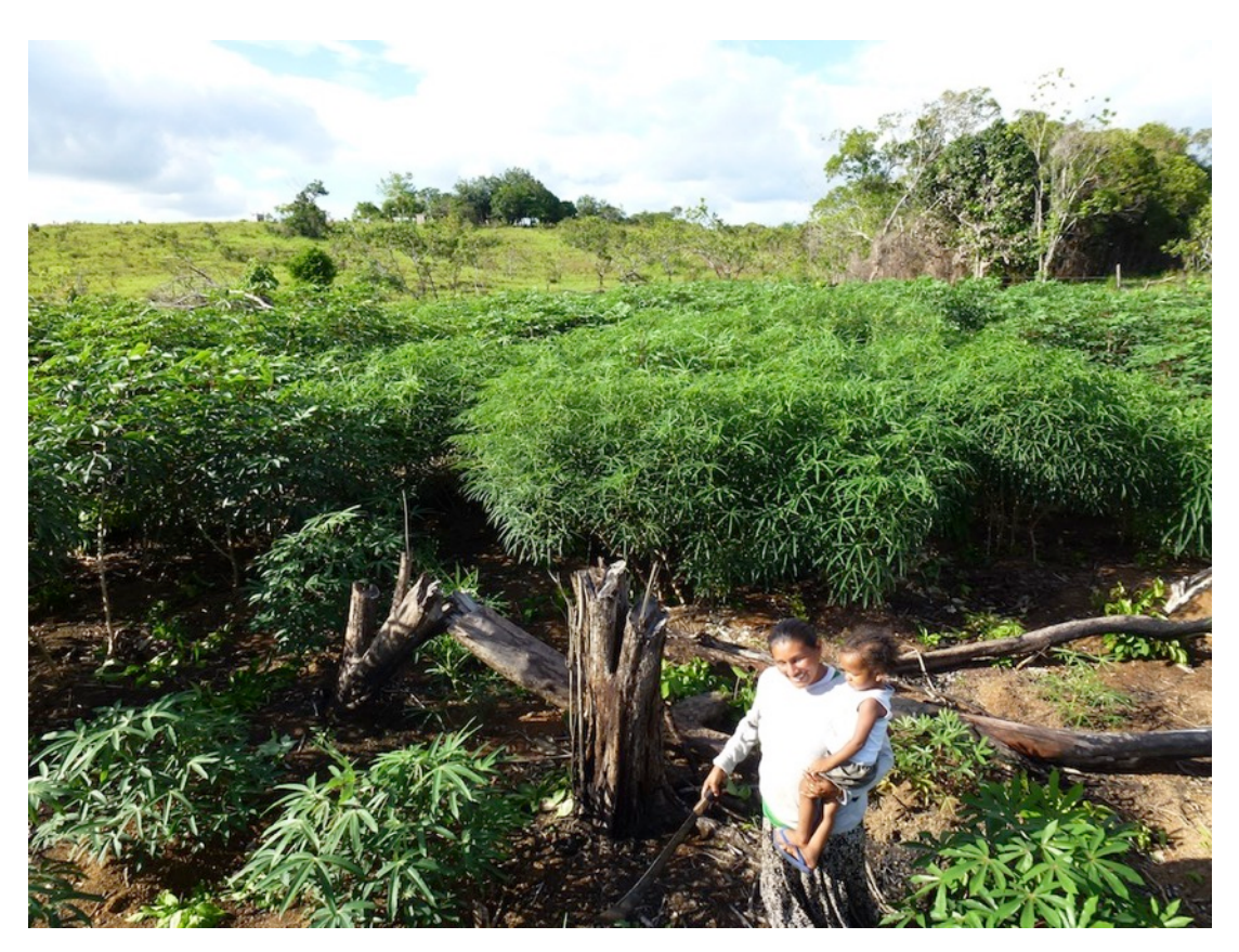
A Makushi farmer and child in their cassava farm (mîî) | Yupukari, 2013

The maintenance of varietal diversity, in my view, is rooted in the complex interaction of a range of economic, ecological, aesthetic, social, and cosmological factors.