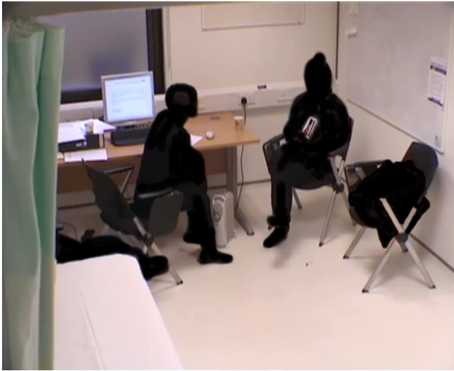
Figure 2 Anonymised screen grab of video footage from this consultation (filmed with consent) showing the non-verbal interaction.