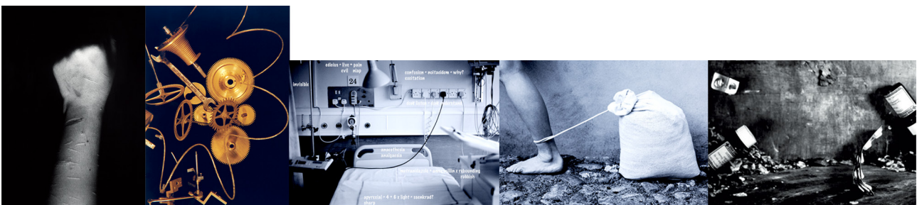
Figure 4 Remaining cards selected by this patient to take into her consultation. All images co-created by Deborah Padfield with patients with chronic pain.

Art psychotherapist Skaife 14 has argued that an image's meaning is made intersubjectively in the context of the moment rather than being a static representation of an inner world, and she asks what the image brings in to that particular situation. Seen like this, the image's meaning is context-dependent. Fire could be warming, destructive, creative or cleansing, but here (as the linguist points out) the effect is that the face is in flames. People on fire might call to mind protest (setting the self on fire) or persecution (burnt at the stake), for example. In this context, the patient's words about the image accentuate the act—something terrible is happening to this woman: 'that person's face is burning off.' In addition to 'self-identity', the image brings something of the patient's anger and distress into the room. The disturbance is heightened by the