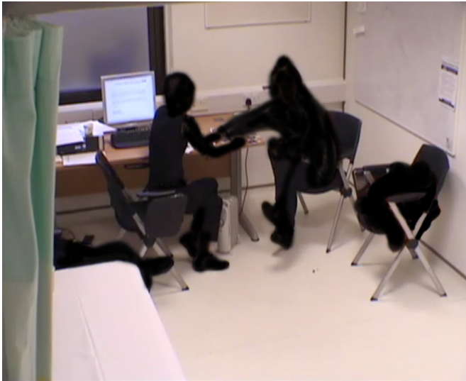
Figure 5 Anonymised screen grab of video footage from this consultation (filmed with consent) showing the non-verbal interaction.

This tendency to provide positive and empathetic responses was observed more generally in interactions around the cards across the 17 consultations. The computer-aided comparison between the interactions around the images and the rest of the consultations shows that clinicians use words suggesting positive evaluation much more frequently around the cards (eg, “fascinating”). Like the patients, they also show a statistically significantly higher usage of words such as ‘feel’, but in most cases the verb is used in reference to an experience of the patient’s, whether to ask for clarification or to show understanding (eg, “This is about how you feel frustrated and tense, yes?”). Moreover, as we have already mentioned, consultants also show higher frequencies of metaphorical descriptions of the quality of the patient’s pain, again to check or confirm their understanding of the patient’s experience (“Okay. So it’s burning, sharp, yeah?”). This further exemplifies the images as a third space, a shared reference point within and against which to check meaning.