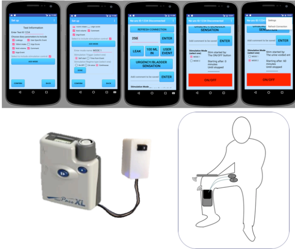
Figure 1: Wireless version of Odstock Pace stimulator with custom Android app

a Bluetooth low energy (BLE) connected switch, consisting of a MOSFET switch controlled by a BLE microcontroller with power source. This switch receives a stimulation profile and switching updates from a custom Android application. To stimulate the DGN electrodes were placed on the dorsum of the penile shaft. Electrodes were placed approximately 2cm apart, the cathode was placed proximally. Stimulation was set to 200 \mu S pulse width and biphasic.