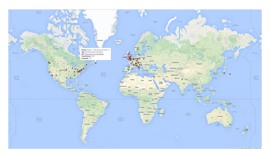
Fig. 1 Screenshot of the map visualization of editions present in the Catalogue of Digital Editions. Note: this is at the time of writing: 2014. (Franzini et al. 2016, p. 170)

[...] the reader will notice a shortage of, for example, Asian and Arabic editions as we work through those in the catalogue. Nevertheless, digital editions appear to be a Western phenomenon, led by the United States and the United Kingdom, two of the wealthiest and most influential countries in the world, both economically and politically (Franzini, Mahony and Terras 2016, p. 172).