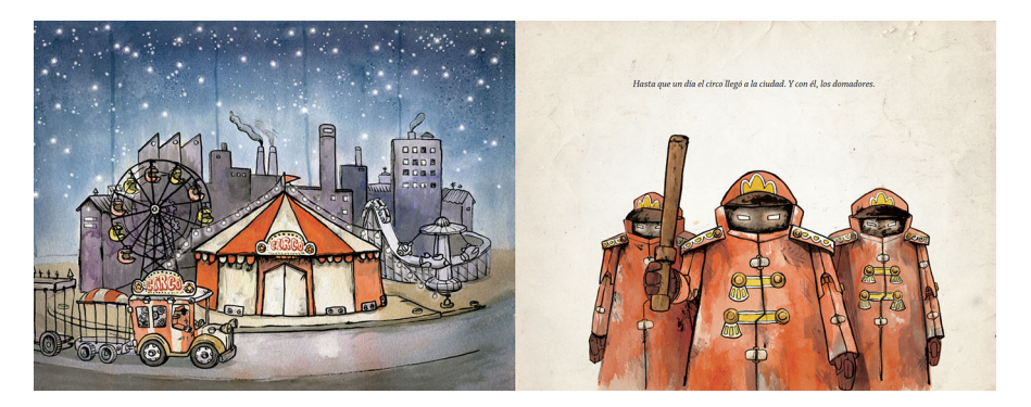
Fig. 1 Illustrations from Historia de un oso . My translation of the text reads: 'Until one day the circus came to town. And with it, the tamers'

Historically, literature has been a place to express utopian visions and subtle criticism of the existing social order. Literature for children has also been used as an effective tool for the dissemination of official ideologies, influencing behaviour and beliefs (Nilsen and Bosmajian, 1996, p. 308; Dorfman, 2009, p. 173). Because the author's own ideology plays a key role when writing for young readers, children's books can also be seen as political acts (Hollindale, 1992, p. 40). Naomi Sokoloff (2005) argues that children's literature "is often less revealing of kids than of ways