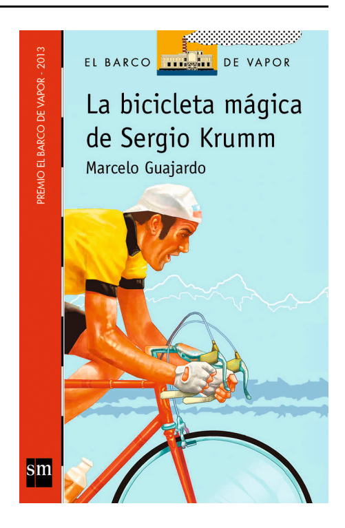
Fig. 3 Cover of La bicicleta mágica de Sergio Krumm

palabras also refers indirectly to violence, disappearance, exile, and the double identities of people living in hiding. In order to alleviate the terror of these events, Moulián adopts a humorous stance in her illustrations and writing. For example, Sofía replaces "fuerzas armadas" (armed forces) with the pun "fuerzas malvadas" (malign forces), and Pinochet with "El mandón" (Big Bossy). However, this strategy is not enough to ease the terror that surrounds Sofía, especially after the secret police kill a maid working in her neighbourhood. Moreover, the use of fanciful language to describe Sofía's world generates a fragmented account that fails to create a credible character, constraining in this way the possibilities for identification.