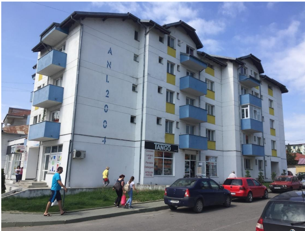
Figure 2: Affordable housing in Romania

Affordable housing is the area into which the small provision of ‘social housing’ was channelled after 2000 in Romania (Frontul Comun pentru Dreptul la Locuire 2014). The National Housing Agency (Agentia Nationala pentru Locuinte or ANL) was specifically established in 1999 to support this type of housing. For example, ANL’s Rental Housing for Young People (‘Locuinte pentru Tineri’) National Programme, backed by Romania’s Central Bank, has since 2001 provided loans, drawing on international financing institutions such as Central European Bank, the Council of Europe Development Bank, or the Deutsche Bank AG (see Figure 2).