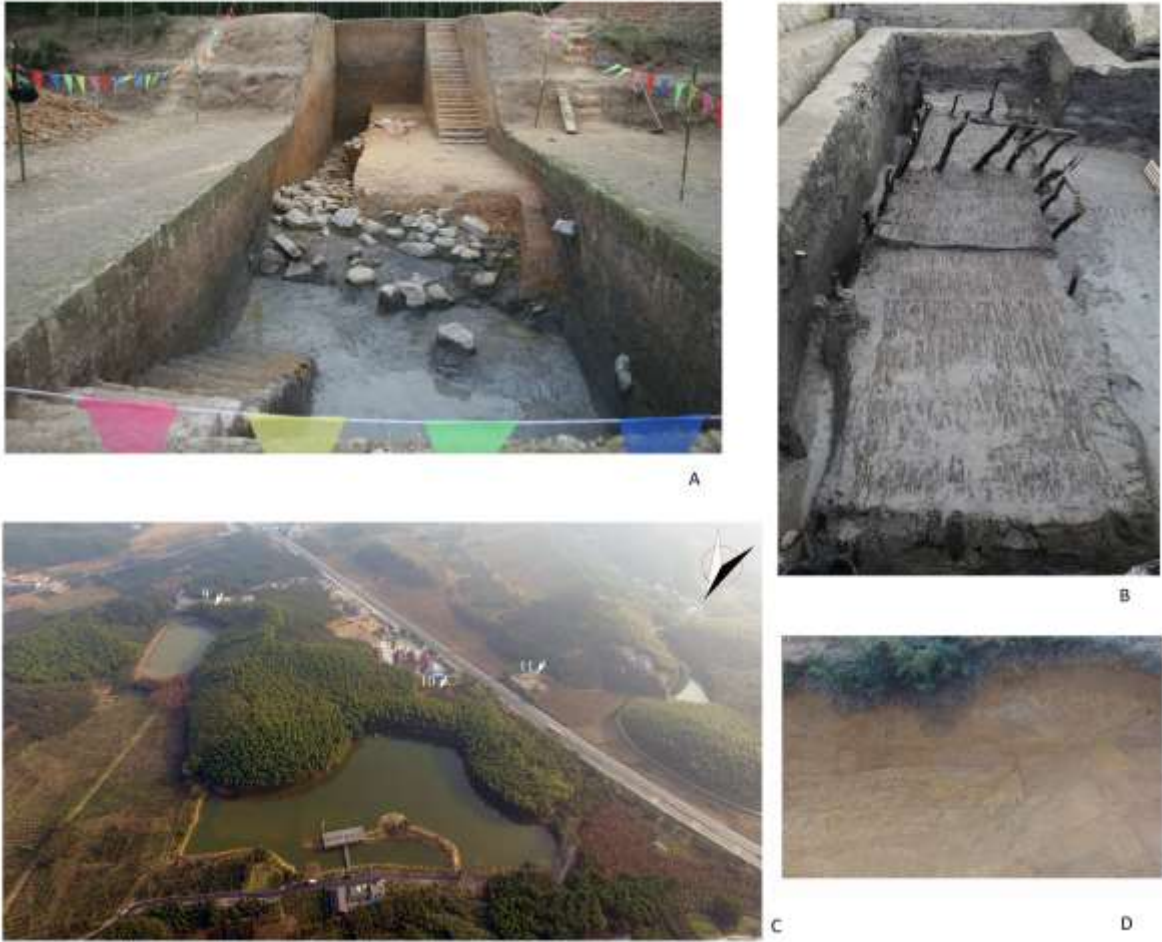
Fig. 3 The 'sand bags' and floated rice remains

(A) One example of the well-preserved 'sand bags', with the knots still clearly visible, the grass plants used are Triarrhena lutarioriparia . (B) A small proportion of rice remains discovered from the storage pit excavated at eastern Mojiaoshan, depth of the boxes around 10 cm.