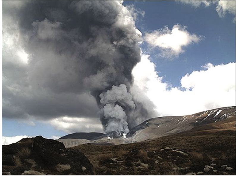
Fig. 2 Eruption at Te Maari Crater, Tongariro, on 21 November 2012, captured by the GeoNet Te Maari Crater web camera

communication and information required, as the local context needs to be considered.