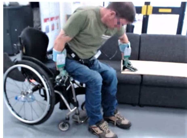
Fig. 2 Set-up of the experiment

2.4 Statistical Analysis: The means and standard deviations of demographic characteristics were computed. Mean TAI score, peak and mean forces for both hands were calculated for each transfer. These were then averaged across individuals for each transfer technique. A one-way analysis of variance (ANOVA) was used to assess the effect of technique and transfer board use on mean TAI score, peak and mean forces under leading and trailing hands. Tukey tests was used for post hoc analysis when significant differences were found. The Pearson correlation coefficient was calculated between the mean TAI score and both peak and mean forces for leading and trailing hands. Finally, we used a paired t-test to evaluate the effect of transfer board use on transfers performed by the same individual. The level of significance for all tests was set at 0.05. The statistical analysis was performed using SPSS 24 statistical software (SPSS Inc., Chicago, IL, USA).