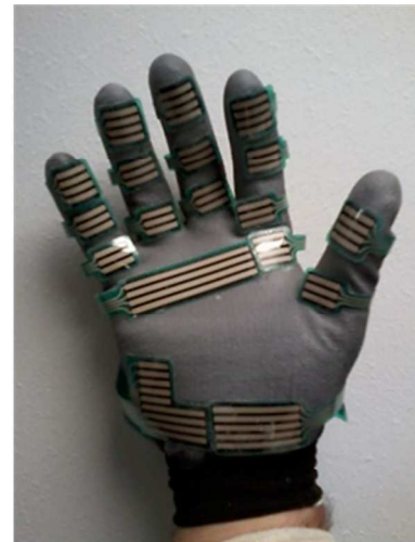
Fig. 1 Position of the sensors on the force sensing glove

leading and trailing hand. Force values below 20N were eliminated from the calculation of transfer mean. This threshold was arrived at after consulting the video and concluding that forces under 20N were often due to baseline noise of the sensors or to contact between the hands and other surfaces (hands resting on thighs).