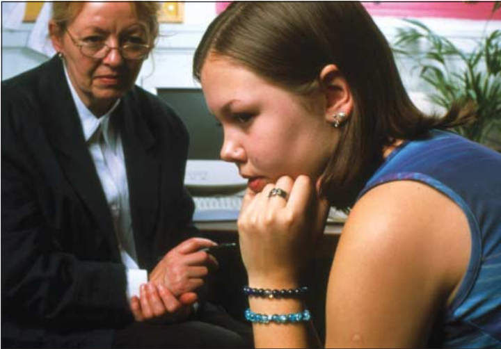
Engaging adolescents in health will produce long term benefits

regularly ( P < 0.0001 ) and six times more likely to have serious psychological distress ( P < 0.0001 ) after sex, age, and social class had been taken into account. 10