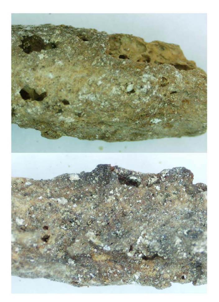
Figure 2. The phalanx with suspected pathology.