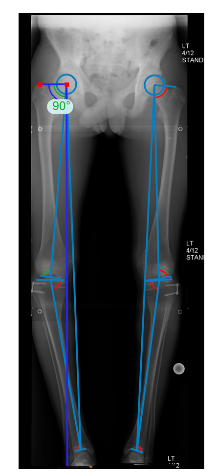
Fig. 4 Anteroposterior standing long leg radiographs of a 12-year-old by showing the measurements made by the TraumaCad software (Voyant Health, Tel Aviv, Israel).

Two patients (four limbs) underwent surgery within the last three months and therefore have been excluded from further analysis. In the remaining 13 patients (26 limbs), there have been no significant complications following surgery but one prominent screw required early revision.