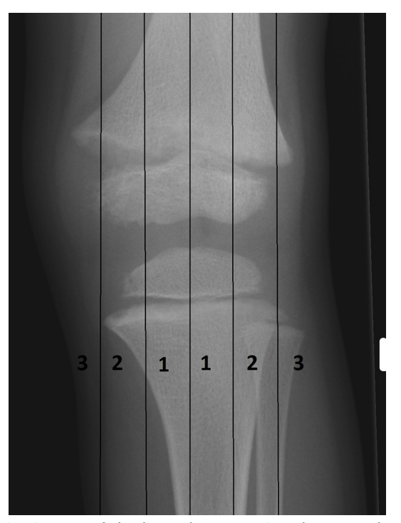
Fig. 3 Diagram of the knee demonstrating that a mechanical axis may pass medial or lateral to the centre of the knee joint or indeed pass outside the knee joint. The degree of displacement of the mechanical axis can be defined in terms of Zones 1, 2 and 3 (medial or lateral). An axis within either medial or lateral Zone 1 is considered to be within normal limits: surgically induced guided growth defined central Zone 1 as fully corrected.

therefore not comment on the effect of poor metabolic control on the response to guided growth. The presence of a mutation of the PHEX gene did not predict requirement for surgery (NS; Fisher's exact test). Similarly, neither gender nor a positive family history were predictors for deformity requiring surgery.