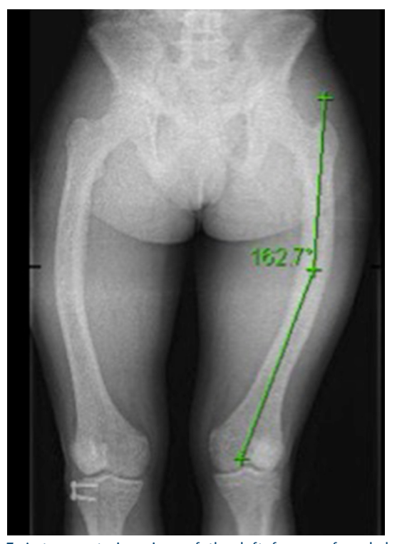
Fig. 5 Anteroposterior view of the left femur of a skeletally mature girl with the diaphyseal deformity of measured at 18°.