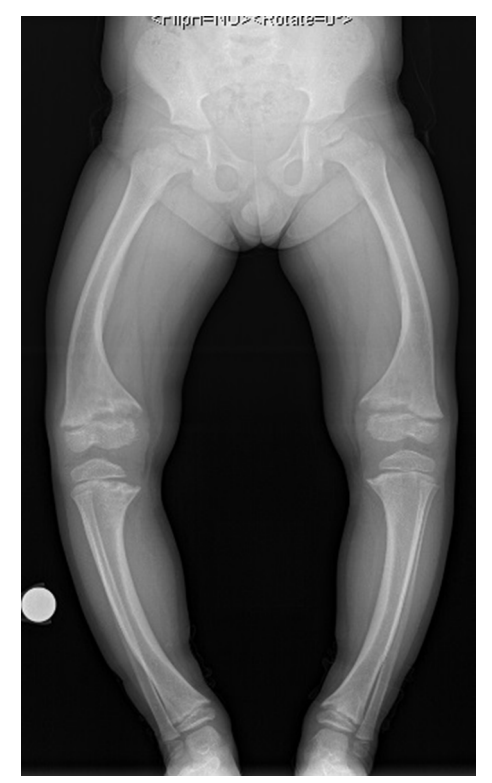
Fig. 1 Anteroposterior standing leg alignment radiographs of a four-year-old girl with X-linked hypophosphataemic rickets after 2.2 years of medical treatment.

Historically, patients frequently presented late or were initially misdiagnosed, and treatment failed to achieve the goals of limiting or improving skeletal deformity. Osteotomies performed early in childhood were associated with a high rate of recurrent deformity.<sup>6,7</sup> More recently, with earlier and better medical care, not all patients develop severe deformity. This, combined with the development of guided growth techniques, suggests that extensive surgery and the associated risks may be avoidable. At our institution, the use of eight-plate (Orthofix, Verona, Italy) hemi-epiphysiodesis for guided growth in these patients was introduced ten years ago as the preferred primary surgical treatment. This study evaluates the effect of this technique on coronal plane lower limb deformity in X-LHPR and determines which factors influence the patient's response to surgical treatment.