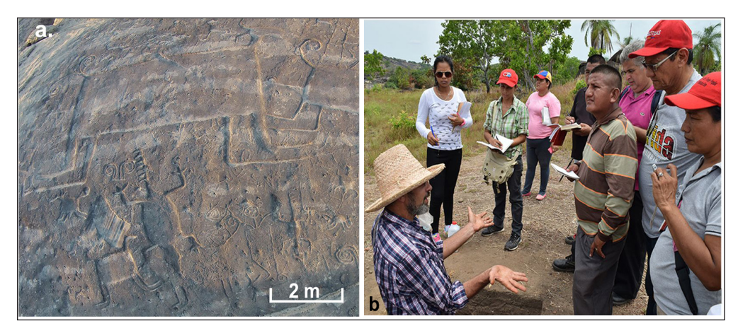
Figure 2: Picure Island (a) Large scale petroglyph; (b) Indigenous teachers belonging to different ethnicities discuss the archaeological excavations and meanings of the rock art from the Island (Photos the Project).

data capture with reflectance transformation imaging (RTI) to capture additional surface detail (Malzbender et al. 2001). Finally, other notable rock art sites such as Cerro Pintado were also visited. Analysis is currently ongoing and a database of comparative rock art is being compiled.