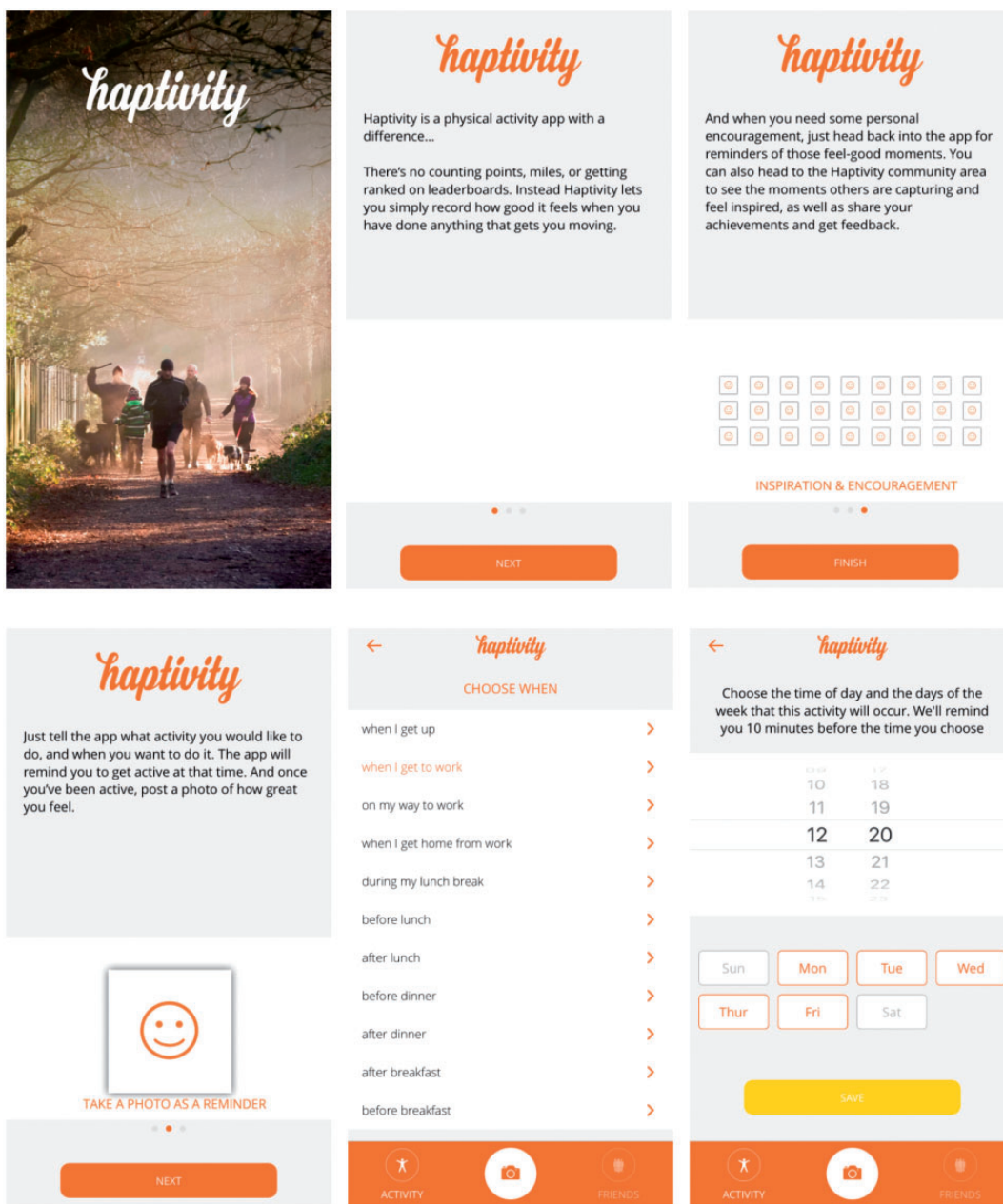
Fig. 2: Images of the app and its functionality.

facilitate future motivation. The encouragement element of the app did create PA motivation for some users, ‘It’s the same as if you were running a race. If people who are supporting you along the way, if you think to yourself, “I’ll give up,” but then somebody’s going to you, “Come on! No, you can do it!” it pushes you’. The ‘activity reminder’ function of the app was also well