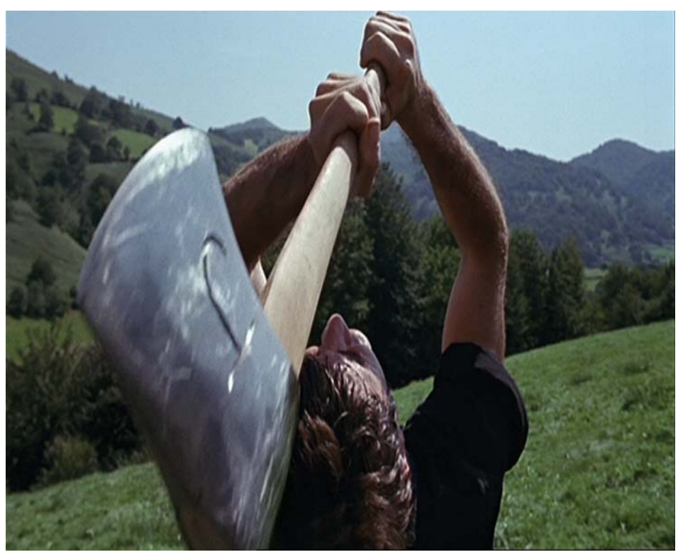
FIGURE 7 Foundational Basque Myth.

If the foundational moment of Manuel's story is his perverse, symbolic rebirth as a coward, the film's foundational visual image, according to Médem, was a woodcutter hurling an axe into a forest (Ángulo & Rebordinos 2004: 191–92) (Figure 7).