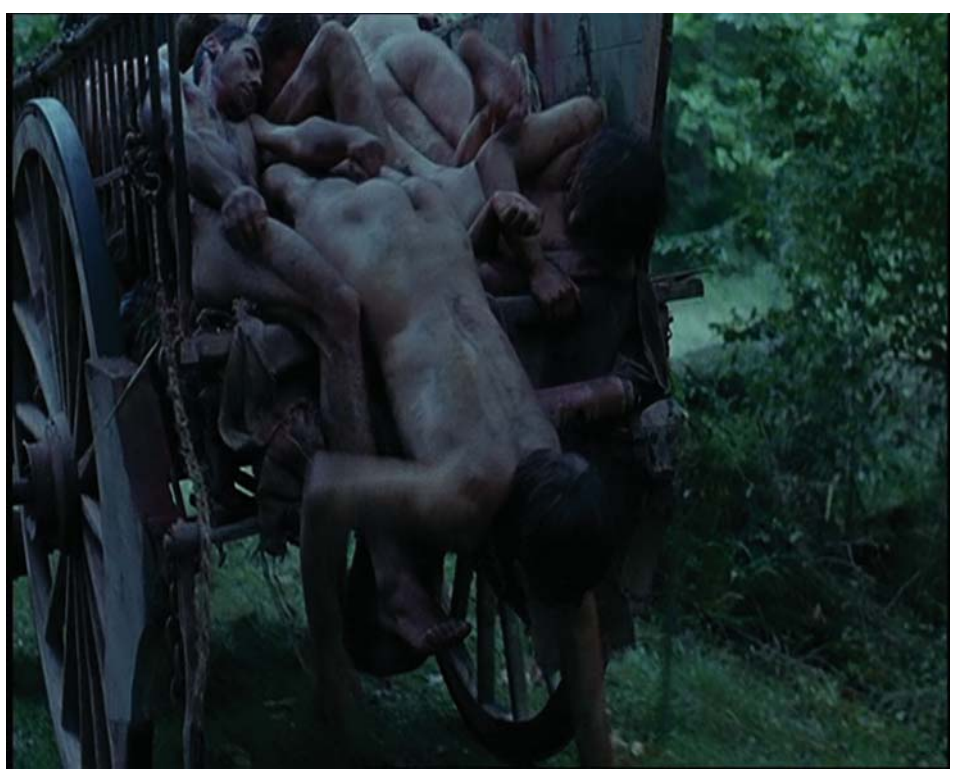
FIGURE 4 Cartloads to the Cemetery.