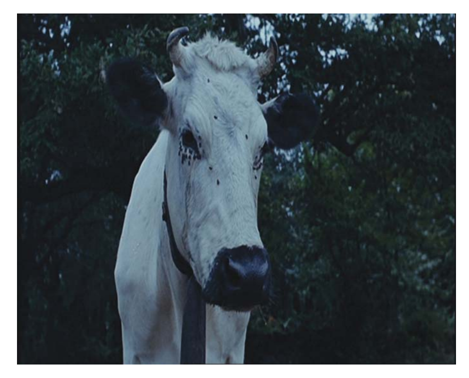
FIGURE 5 Regarding the Bovine Midwife (I).