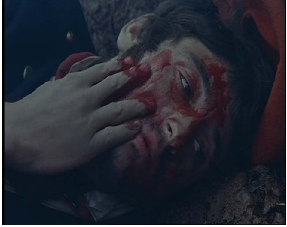
FIGURE 2 Symbolic theft of the patriarchal bloodline.

the representation of Manuel's symbolic rebirth as a coward Médem makes direct reference to Goya (Figures 3 and 4). ^{23}