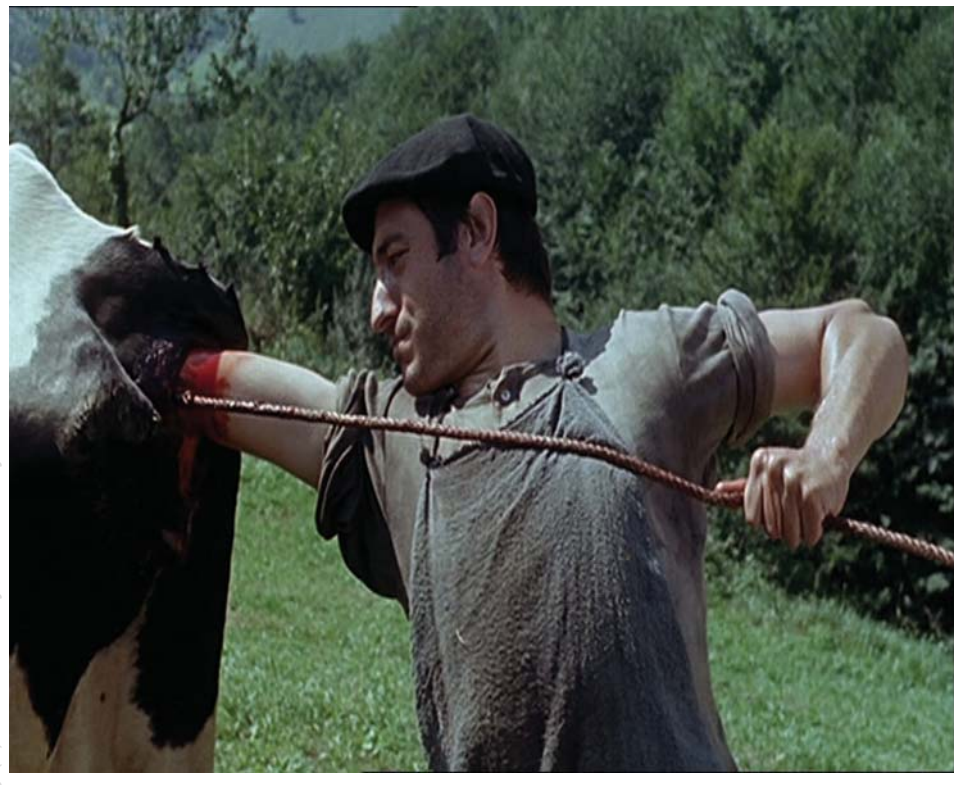
FIGURE 8 Male-assisted birth 'not of woman'.