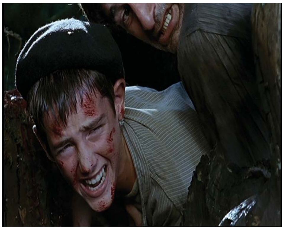
FIGURE 9 Male-assisted re-birth 'not of woman'.

to the film narrative and the almost neurotic cinematographic returns to the perverse maternal metaphor of the hollow tree stump, suggest the viewer is required to pay particular attention to the way foundational myths repress the maternal metaphor.