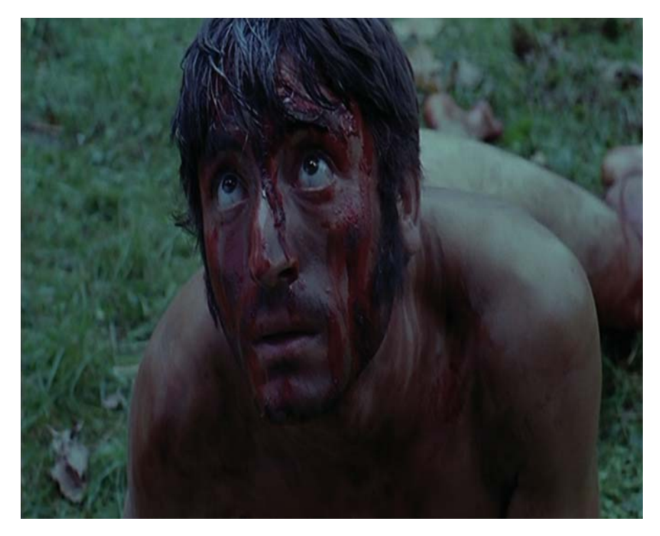
FIGURE 6 Regarding the Bovine Midwife (II).