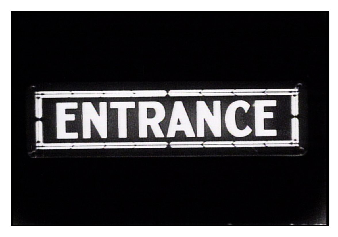
Figure 3 Film still from: George Brecht, Entrance to Exit (Fluxfilm no. 10), 1965, 7 minutes, black and white, sound. Courtesy Electronic Arts Intermix (EAI), New York and Anthology Film Archives © VG-Bild-Kunst, Bonn 2016