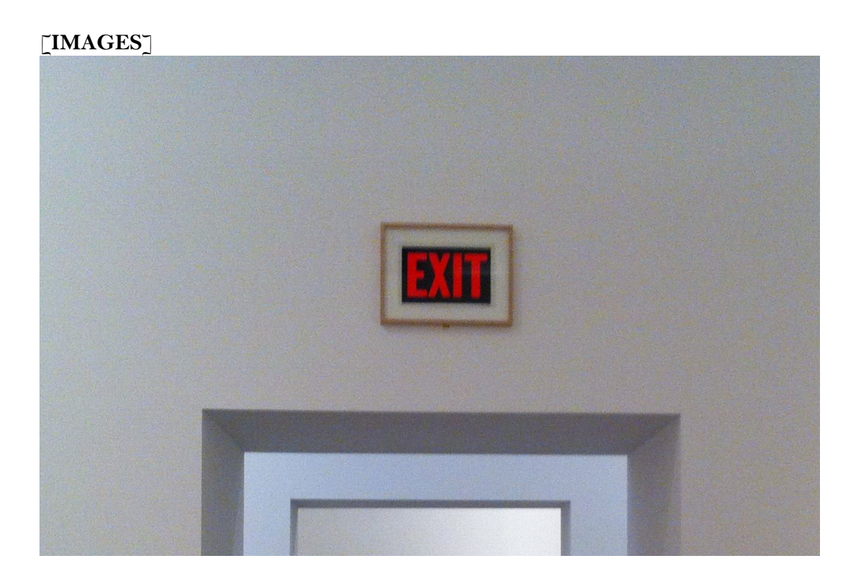
Figure 1 George Brecht, Exit (Word Event), no date (after 1961), removable plastic foil on cardboard.