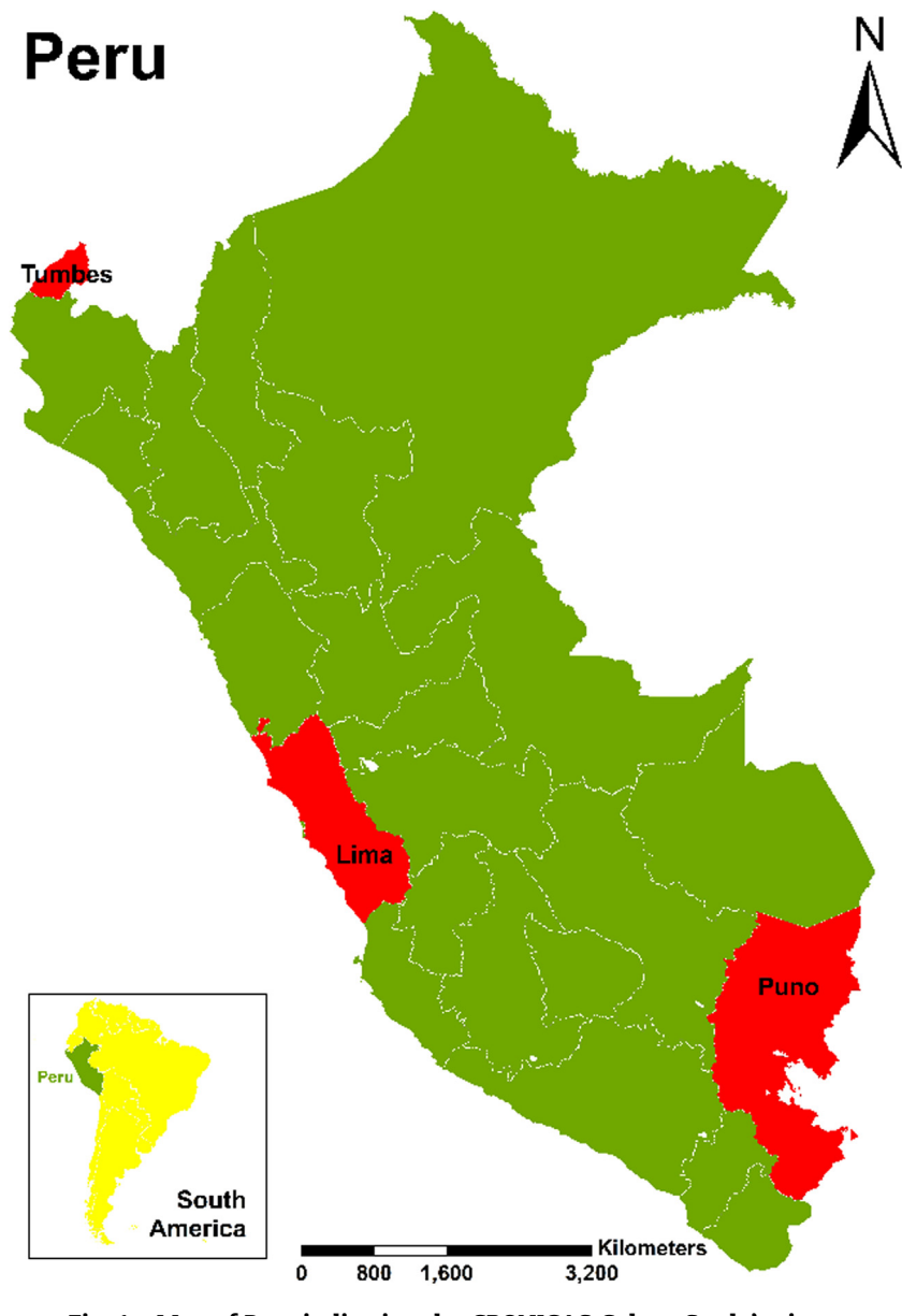
Fig. 1 - Map of Peru indicating the CRONICAS Cohort Study's sites.