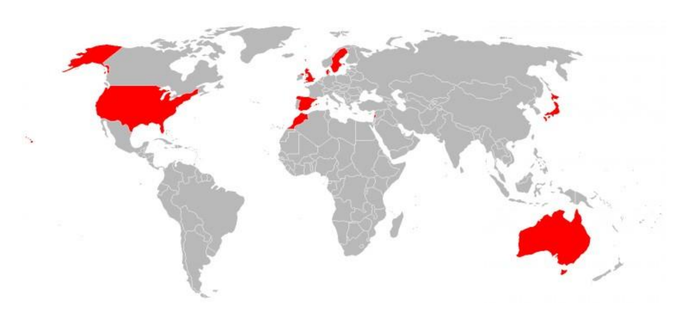
Figure 1 Locations of the 20 studies contributing to the InterLACE study

There are ten participating countries: Australia, Demark, Sweden, Norway, UK, USA, Japan, Lebanon, Spain, and Morocco.