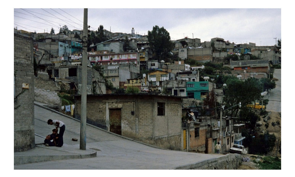
Figure 2. Lomas de San Agustín, Mexico City, 1982.