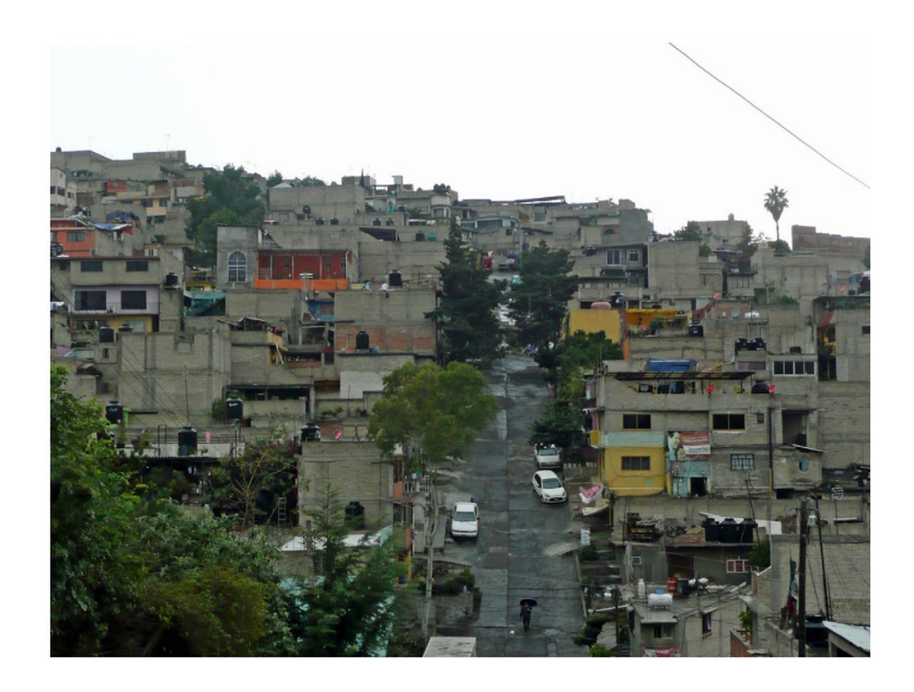
Figure 3. Lomas de San Agustín, Mexico City, 2012.

neighbourhood in the "high" category in Table 1, it had always been the preserve of wealthy residents, including a former mayor of Mexico City and a Supreme Court judge in the 1980s. They were no doubt attracted by the large (and inexpensive) plots on a mountainside location with sweeping views over the south-west of the city, and could afford their own solutions to the problem of urban services.