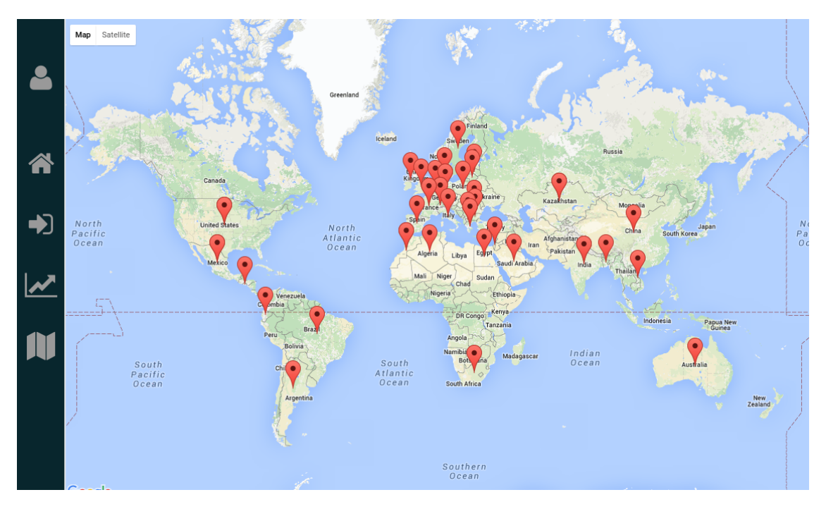
Figure 4: Location of visits to the embedded honey links.

In Google spreadsheets, there are limitations on the functionality of Google Apps Script for users that are not logged in. Since visitors are not required to login before interacting with the spreadsheets, there are limits on the amount of information we can collect on the visitors, and also how much activity we can monitor in the spreadsheets. This is an intrinsic limitation of our monitoring infrastructure.