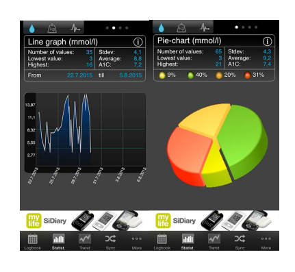
Figure 6: SiDiary showing 14-day graph and Pie Chart