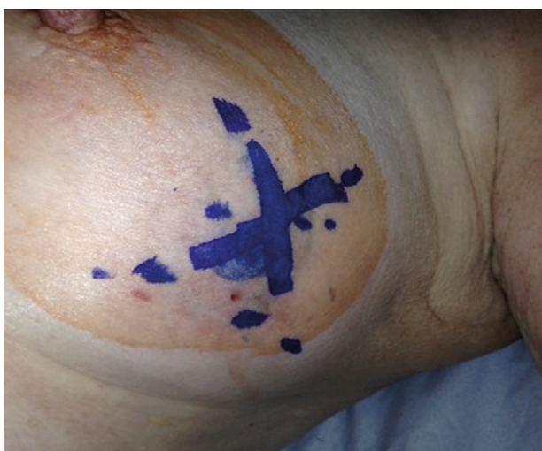
c Skin marking over lesion

Trial 7 , which demonstrated the non-inferiority of the magnetic technique for SLNB detection in breast cancer compared with the standard ‘dual technique’ comprising use of radioisotope and blue dye. The findings of the SentiMAG Multicentre Trial 7 were subsequently confirmed by the Central-European SentiMAG Study 8 . Superparamagnetic iron oxide (SPIO) has been used to perform SLNB in breast cancer 7–9 , and is one of the most promising radioisotope-free techniques 10 . Once injected interstitially into the breast, the SPIO travels to the axillary lymph nodes and is distributed within the sinuses, subcapsular space and parenchyma of the nodes 11 . Iron is sequestered within macrophages before being broken down and distributed across iron stores in the body 12 . The magnetic tracer can be detected during surgery using a handheld magnetometer, allowing the SLNB independent of radioisotopes 7–9 .