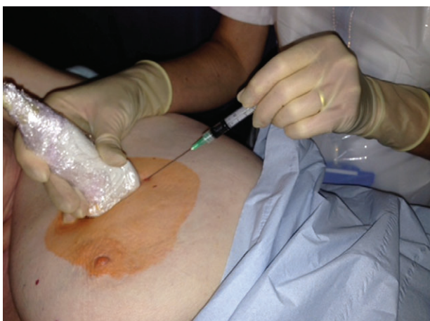
b Injection of magnetic tracer