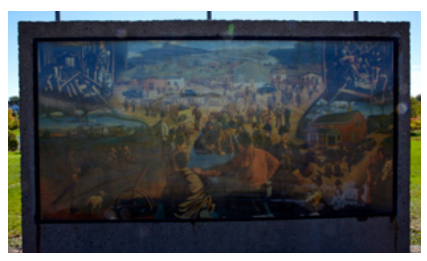
Figure 9. The Mine Fatality Mural

bottom-right speaks to a reality that no longer exists; while many sons followed their fathers into the mines in the early twentieth century, by 1985, when the mural was created, local industry was already in crisis. Today, these images prompt questions for New Waterford's future: what happens to a 'mining town' when the mines no longer exist? How will the experiences of industry and post-industry be framed? Most importantly, what comes next for a community that has been economically de-centred by the end of the coal industry?