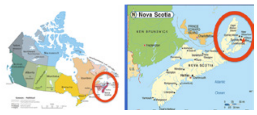
Figure 1. Map of Cape Breton Island

industrial communities. Music and song played a significant role in this process. Many protest songs and poems of local composition were sung and recited throughout the industrial communities; some were published in the Maritime Labour Herald throughout the 1920s.<sup>2</sup> These compositions focus on local events, personalities and places, tragedies such as mine accidents, the industrial conflicts of the 1920s, and the attitudes of workers toward management. These songs are often tinged with satire and witty analysis of working-class life. Some have entered oral tradition and others did not; however, they provide us with a snapshot of the attitudes and values of the Cape Breton workers during the early twentieth century.<sup>3</sup>