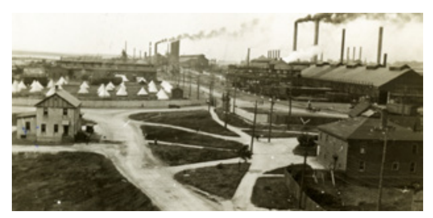
Figure 2. Soldiers at Steel Plant, 1923

of these industrial workplaces to support the company and intimidate striking workers.<sup>20</sup>