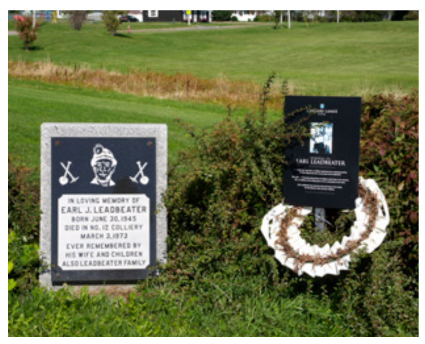
Figure 4. Leadbeater gravestone