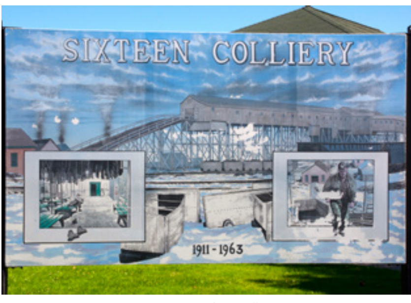
Figure 7. Number 16 colliery