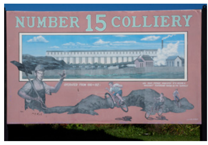
Figure 6. Number 15 colliery