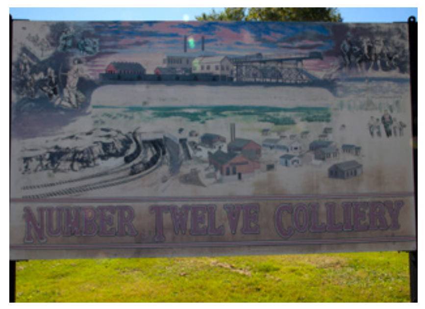
Figure 3. Number 12 colliery