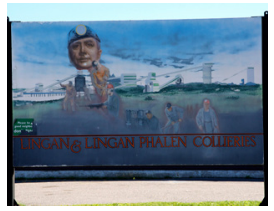
Figure 8. Number 17 colliery

New Waterford miner. As the viewer 'reads' the mural, examining the images placed clockwise from the bottom-left, a story unfolds; we see miners loading coal boxes — an ordinary day, this is followed by a collapse in the tunnel that pins a miner to the floor. Finally, in the bottom-right corner of the mural, the miners' wake is depicted; family and friends carry a casket to the front door of a company house. The bereaved family, including a toddler wearing a mining helmet, looks on in the foreground.