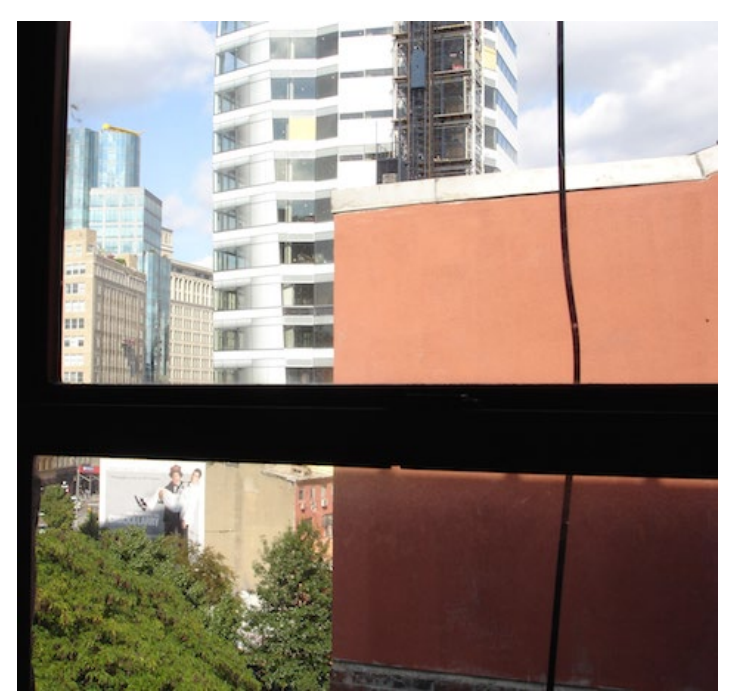
Figure 2. The Cooper Square neighbourhood under gentrification pressures: view from inside a CLT apartment

In Cooper Square, the timing could not have been less fortuitous. Robert Moses' plan was only defeated after a prolonged battle that lasted from 1959 to 1971. In 1971, "we got the green light from the city that they would accept our plan which was 'The Alternate Plan.' So, when they gave us the green