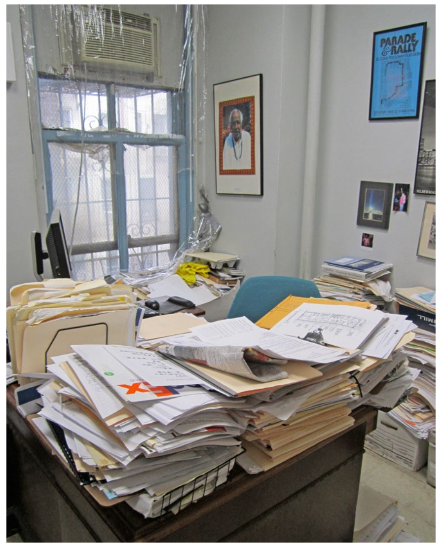
Figure 5. The cluttered desk of an activist or overworked professional?

We find a language of advocacy which is more than a professional buy-in to the principles of the CLT and of the activism behind it: