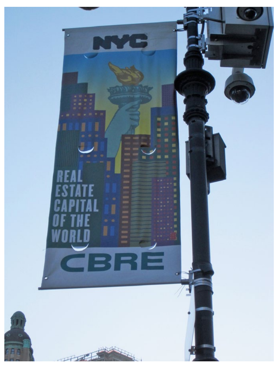
Figure 1. Cooper Square and the 'Real Estate Capital of the World

One of the organizers explained that, even with a long tale of immigrant workers arriving into the neighbourhood, it has never fitted the sociological model of a "melting pot" and is a place where communities, and people in those communities, pursue their religion and politics as they remain relevant to their culture. The Cooper Square Committee was formed in 1959,