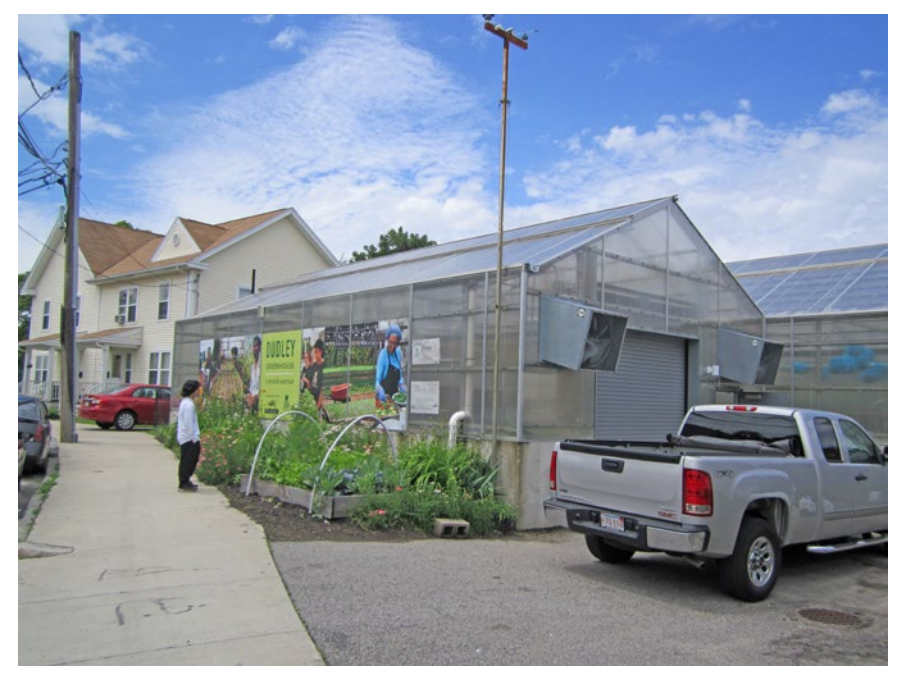
Figure 3. Growing your own activists, Dudley Street

This is confirmed by a meeting with a local councillor in Dunkin Donuts in nearby Blue Hill Avenue, part of the symbolic boundary of the Dudley Triangle, where the message is one of value creation by DSNI and how their intervention has led to neighborhood stabilization and, not least according to the politician, has provided a foundation that has overcome disenfranchisement and exclusion.<sup>35</sup>