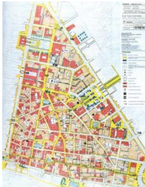
Fig. 3. Aravantinos et al, Master Plan for the Historical Centre of Athens, Urban Research Laboratory, School of Architecture, NTUA (1996): Proposal

The successful bid for the hosting of the 2004 Summer Olympics in 1997 was considered a rare opportunity for economic growth on the one hand, and the incorporation of Greek cities into the global cities' network on the other.[14] The recently adopted regulatory plan of 1985 did not however, foresee the accommodation of activities and land uses associated with such a mega-event. Consequently, the already debilitated and weakened plan was unable to meet the new goals. However, since time was a critical factor for meeting the criteria of the 2004 candidacy file, the necessary interventions were realised without updating the existent regulatory framework. Furthermore, no attempt was made to compile a new plan that would meet the new demands but rather, an emergency law was adopted in 1999 for the planning of the Olympic facilities.[15] Its major objective was the reduction of the time and paperwork required for the realisation of infrastructure projects. Although it was referred to as an 'update' of the regulatory plan, in essence, it was the quite opposite- it represented its abolition.