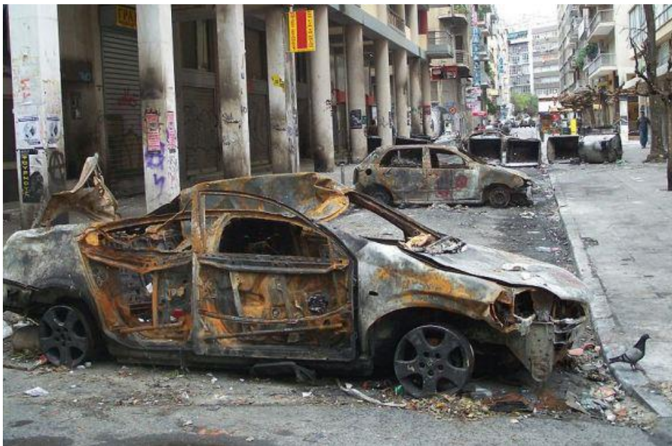
Badseed, Barricade at Stournari street during Athens riots, 2008.