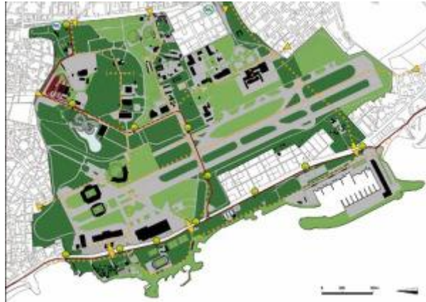
Fig 4. N. Belavilas et al, Master Plan of Ellinikon Former Airport Metropolitan Park of Athens, Urban Environment Laboratory, School of Architecture, NTUA (2010): Proposal