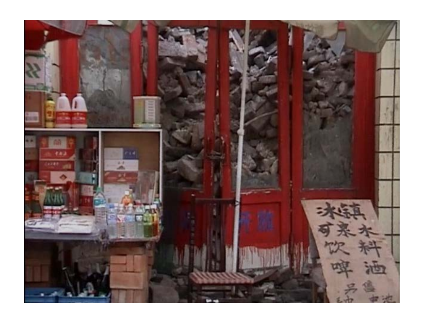
Meishi Street (2006)

'In China, what makes an image true is that it is good for people to see it'.