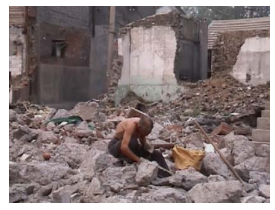
Meishi Street (2006)