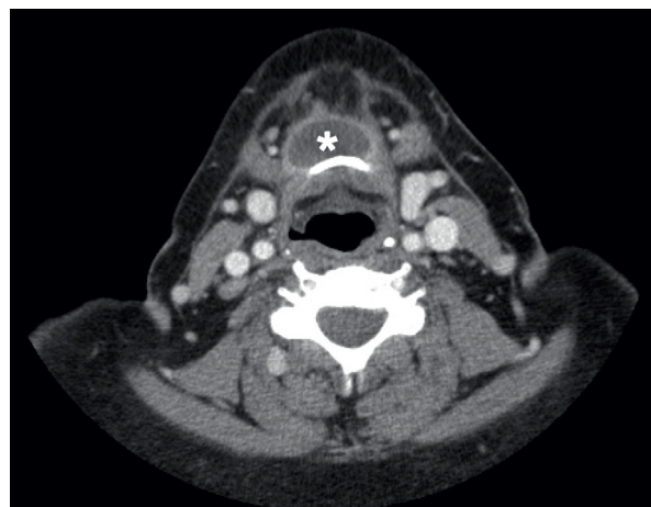
Fig. 3. CT scan of the neck on postoperative day 21. An axial, post-contrast CT scan of the neck at the level of C3. The asterisk denotes the position of a 2.7 cm simple cyst with a thin enhancing wall consistent with an infected thyroglossal cyst. Chrysostomos Tornari and Bhik T Kotecha

A CT scan of the neck demonstrated an infected thyroglossal cyst without any tongue base or deep neck collections (Fig. 3) and a subsequent ultrasound-guided needle aspiration reduced the size