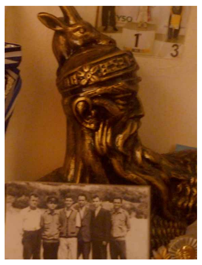
Fig. 6: Scanderbeg's souvenir bust on display in the living room of Galatsi family.