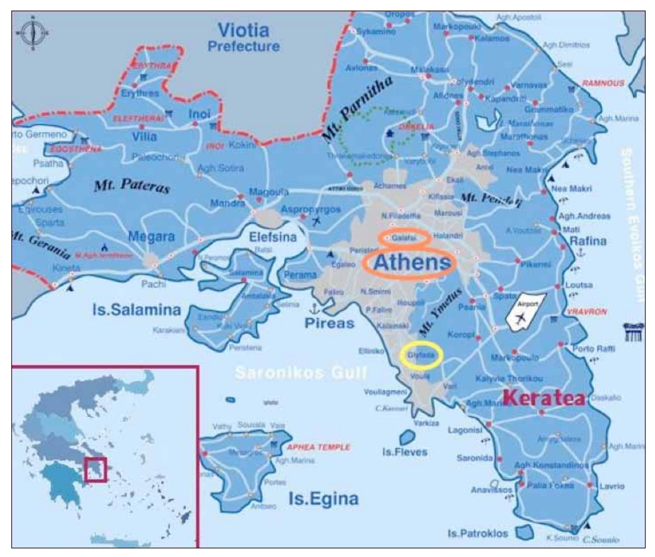
Fig. 2: Map of Attica Prefecture. Circles in orange indicate the families' locales and circle in yellow stands for the researcher's locale, while in fieldwork (www.web-greece.gr).

their domestic settings, I joined them in outdoor daily and leisure activities including kickboxing and dancing lessons; grocery, flea-market and gadget-shopping; theatre and museum visits; school festivities; walks in the neighbourhood; and visits to relatives' and friends' houses.