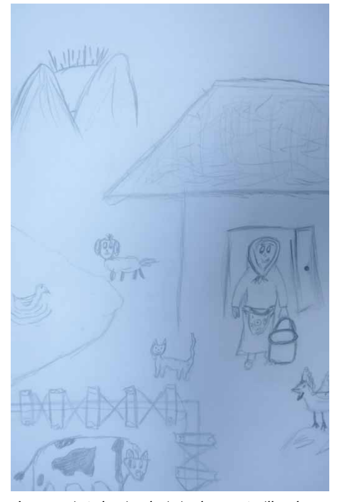
Fig. 4: Zamira's drawing depicting her aunt's village house in Albania.

their place of origin unfolded in practices of renovating their parents' village houses sustaining the myth of return (Salih, 2002; Buciek et al. , 2006). Artan is currently building up an extra floor in his parents' house to make room for his nephews and nieces to stay over when visiting from Athens.