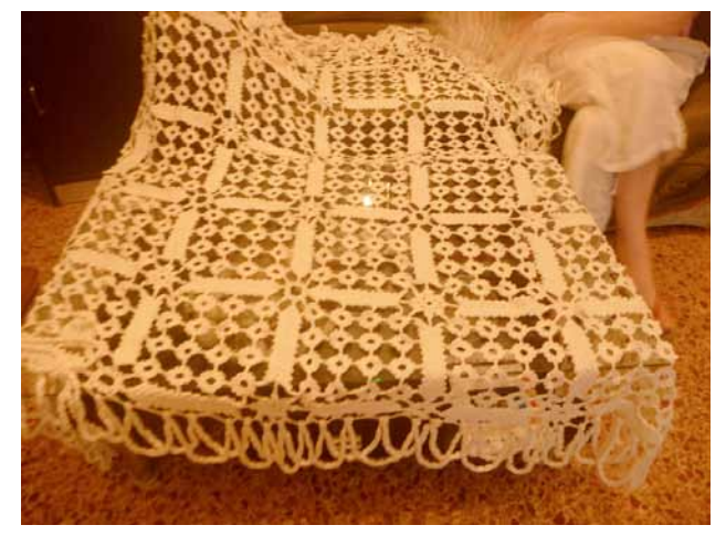
Fig. 10: Adelina's hand-knitted tablecloth from her mother in Albania.

and white photo of Drita's great-great grandfather on display in the family's flat manifested the mother's tangible claims for roots. Emitting accounts of 'tribes and families' from the place of origin handed down from parents to children, the treasured photo provided a sense of rootedness within the family sustaining its cultural memory (Turan, 2010: 44) (Fig. 9).