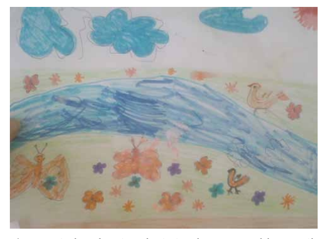
Fig. 3: Mirela's drawing depicting her parental home village in central Albania.