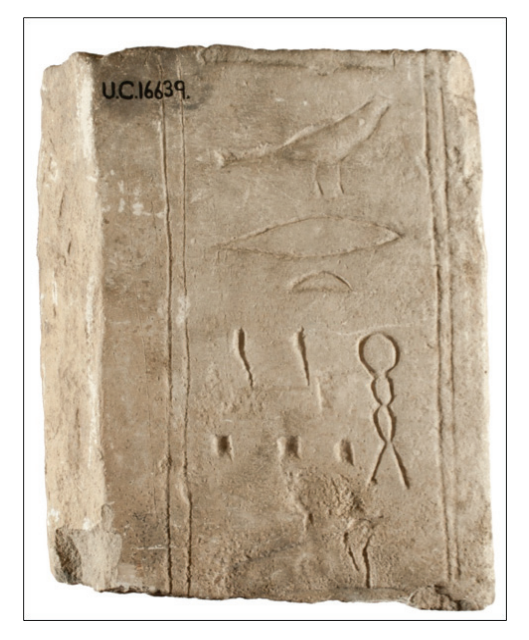
Fig. 1: A left jamb fragment, UC 16639.