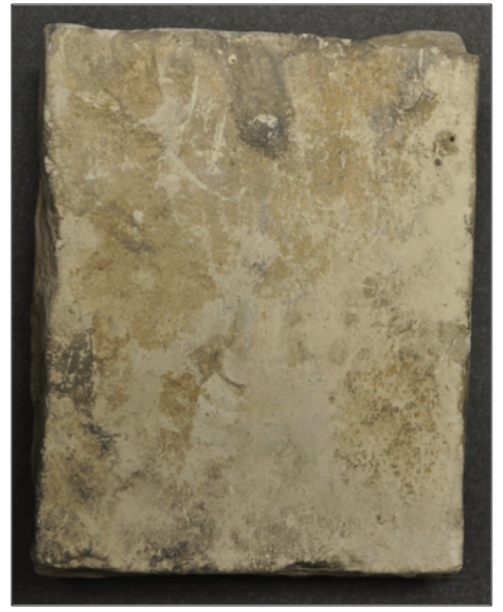
Fig. 3: The back of UC 16639.