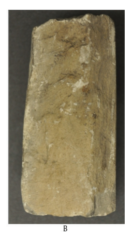
Fig. 2: The right (A) and the left (B) sides of UC 16639.

formed. The lower part may have been recarved. The hieroglyphic inscription is interrupted at the top and bottom of the block, indicating that it is a part of a vertical stack of blocks (cf. Arnold 2003: 74). The right side of the block is almost flat while the left side is rough and leans at an angle ( Figure 2 ). There