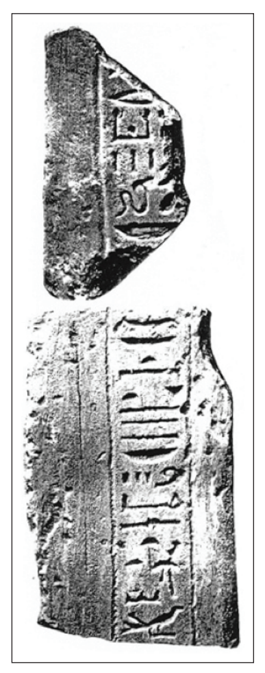
Fig. 4: Jamb invoking Werethekau of the temple of Aniba (Steindorff 1937: 23 (30), Taf. 10 (28))

Arkell described the block as follows: 'Limestone fragment with a column of hieroglyphs between double incised lines "great lady of magic Sebek" (Museum Register). Regardless of Arkell's translation for the names engraved on this fragment (see below), this information is not enough to determine what the fragment represents. The object could be a left jamb of a door of a small chapel or shrine (cf. Habachi 1985: pls. 8, 38, 79b, 100; Spencer 1997: pls. 94, 122). The fragment can also be compared with two sandstone fragments of a jamb found in Aniba Temple (Figure 4) and dating to the Nineteenth Dynasty (Steindorff 1937; 23, pl. 10, 28). However, the material and the style of sunken relief of the Aniba inscription are different. The name of Werethekau and her epithets are mentioned on these fragments from Aniba: 'Werethekau, lady of the [palace], lady of heaven, mistress of all the lands, she may give the great west...' (Steindorff 1937: 23 (30), pl. 10, (28); for the