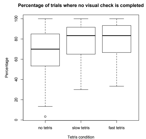
Figure 4: Graph showing percentage of trials where no visual check was completed.

The former of the two checking behaviors involves lower time costs (Gray, Sims, Fu, & Schoelles, 2006), but is potentially more risky, as the memorized number may be incorrect. This strategy was used significantly more often for users of the serial interface compared to the incremental interface.