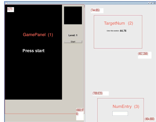
Figure 1: Number entry screen showing the components. It shows the target number to be entered (44.76), the entry box where the typed number will be shown and the Tetris game panel on the left.

Participants were given two different interfaces to use when entering numbers. The serial number interface involves entering a number, one digit at a time in much the same way as a telephone number. In the serial number entry task, the keyboard number pad was used. The incremental interface asked users to add amounts to a value on screen. During incremental number entry, the number pad was adapted with chevron keys (see Figure 2). The single chevron keys either added or subtracted 1 from the number on screen whereas the double chevron keys added or subtracted 0.1 from the number on screen. Regardless of interface type, the arrow keys were used to control the Tetris game. The numbers participants were required to transcribe were randomly generated numbers ranging between 0 and 100 and had two decimal places (e.g., 97.96).