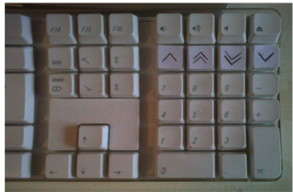
Figure 2: Keyboard used for number entry during the experiment. Serial number entry was completed on the number pad, whereas incremental number entry was completed using the chevron keys.