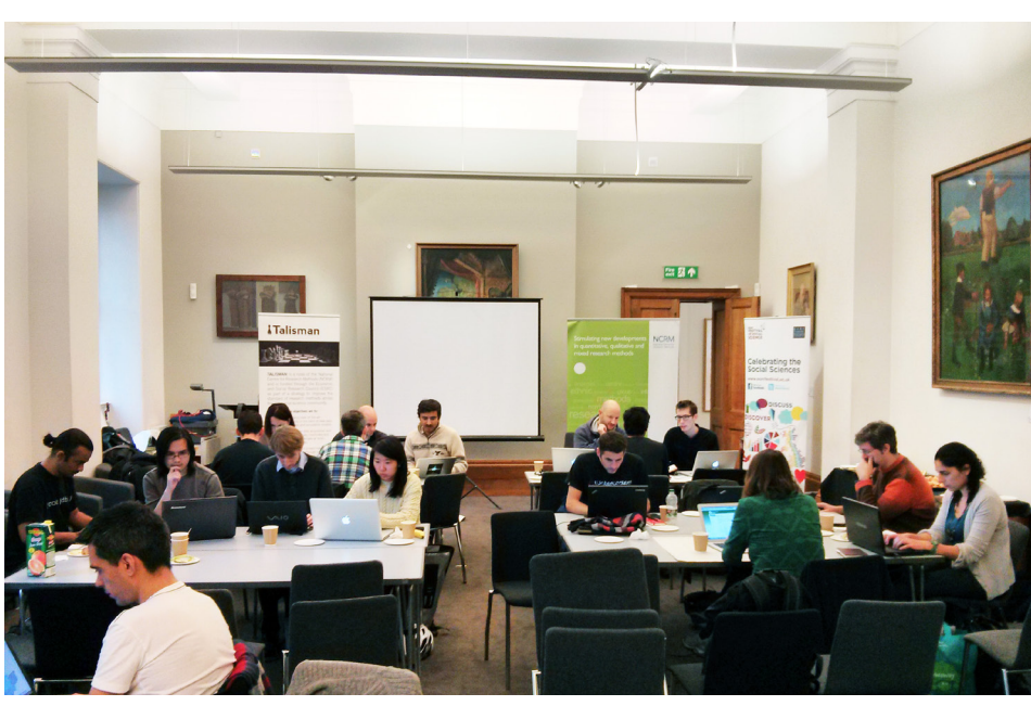
Photo: Hackathon teams on the second evening of the event. The teams were formed, project specifications defined and work on the projects started.

The outcomes of these challenges included concepts for: identifying commuters vs leisure cyclists from "Boris Bikes" usage data; a mobile location based Monopoly-type game with house prices; customisable "house hunting" online map allowing users to prioritise the attributes of an area; and a river level alert system.