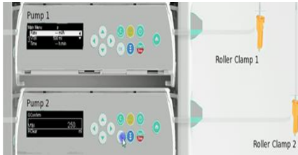
Figure 1. Pump simulator.

Traditionally, the focus of chart improvements has been on transcription legibility and ensuring all relevant information is recorded [1]. Charts are often highly structured documents with restrictions on the nature and format of what can be recorded. This can make it impossible to appropriate them in a way that supports an individual's device programming activities. We are concerned with how chart design influences the end-user programming procedure, and how this impacts on the likelihood of errors being made. Our focus is on how safety manifests itself in everyday practice using prescription charts, and how those practices are developed through training and experience.