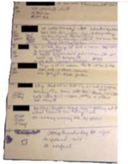
Figure 3. Bespoke chart.