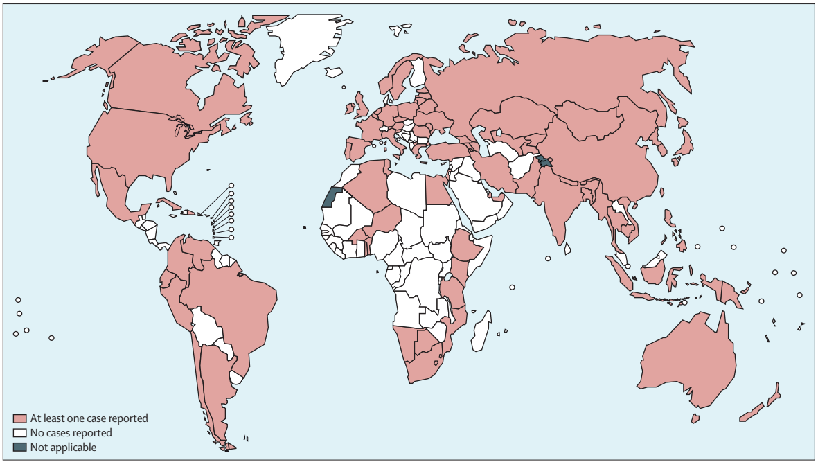
Figure 1: Countries with at least one case of extensively drug-resistant tuberculosis by the end of 2011 Reproduced from WHO's global tuberculosis report 2012,<sup>2</sup> by permission of the World Health Organization.

Correspondence to: Prof Alimuddin Zumla, Centre for Clinical Microbiology, Department of Infection, University College London Royal Free Campus, Royal Free Hospital, London NW3 2PF, UK a.zumla@ucl.ac.uk