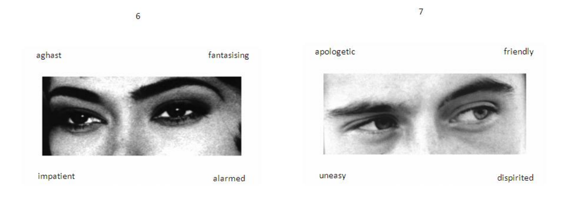
Figure 3 displays 2 of the 36 questions, illustrating the presentation and multiple choice question format. In these examples, the answers are: (6) fantasising/female; (7) uneasy/male.

This 10 minute test is widely used in research and has successfully differentiated mentalization impairments in a number of clinical populations including Autism (Baron-Cohen et al., 2001), Schizophrenia (Schimansky, David, Rossler, & Haker, 2010), brain injury (Stone, Baron-Cohen, Calder, Keane, & Young, 2003) and sex offenders (Elsegood & Duff, 2010). In the original study, a one-way ANOVA comparing the 4 groups on the revised Mind in the Eyes task revealed a significant main effect of group, F(3,250) = 17.87, p = 0.0001. The answers have been subjected to a consistency check so that the target word was identified at least 50% of the time and the foil word no more that 25% of the time. The test does not show floor or ceiling effects. In this study, the measure was used to assess the external dimension of mentalization and both cognitive and affective impairments.