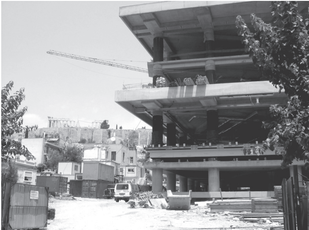
PLATE 2. VIEW TOWARDS THE ACROPOLIS HILL FROM THE BACK OF THE NEW ACROPOLIS MUSEUM, CHATZICHRISTOU STREET

ancient objects with the Acropolis monuments (Hellenic Ministry of Culture 1990, 11). However, the Association of Greek Architects reacted against the construction of a modern, high building in the vicinity of the Acropolis. At the same time, local inhabitants living in the surrounding plots reacted against the museum construction and the expropriations of their flats, required for the construction of the museum. Both the architects and the local inhabitants at that time denounced the museum construction to the Supreme Judicial Council, which finally decided to interrupt the implementation of the museum project in September 1993 ( Τα Νέα 25/11/93). Opposition to construction of the museum in the Makriyianni plot was also voiced by international architects who requested the Greek government cancel the first architectural competition and proclaim a new one ( Τα Νέα 24/07/1997). As a result, in 1995, in order to accelerate the process of the museum construction, the Greek Parliament established the Organisation for the Construction of the New Acropolis Museum (OANMA) as a private legal entity supervised by the Ministry of Culture (Παπαχρήστος 2004, 442).