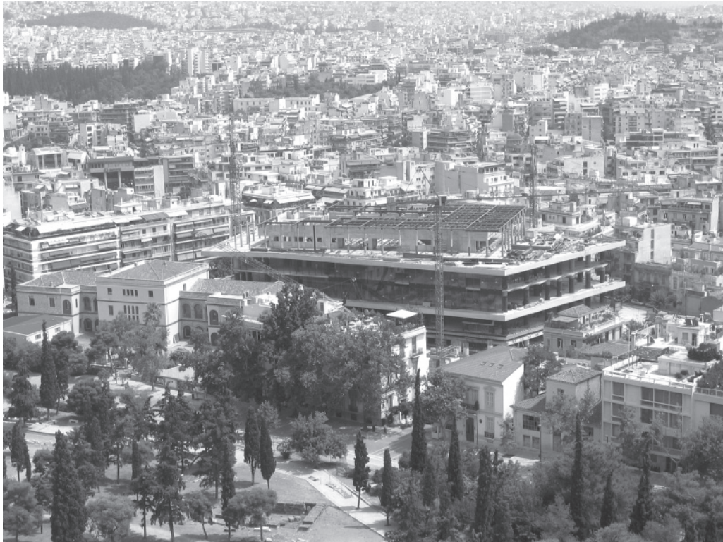
PLATE 1. VIEW OF THE NEW ACROPOLIS MUSEUM FROM THE ACROPOLIS

Keywords: Culture heritage management, New Acropolis Museum, Athens, Greece, conflict management, game theory