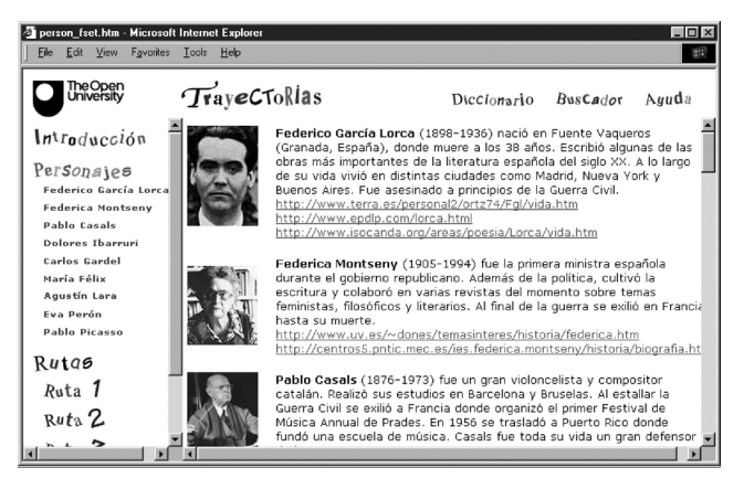
Fig. 3. Presenting real and complex settings.