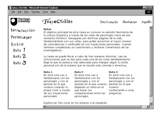
Fig. 4. Help the learner become self-aware: choice of instructional styles.

follow, relating the information within these, and interpreting it according to her interests and mental structures.