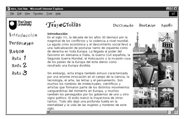
Fig. 2. Orientation on meaning: Task's introduction to the historical context.

and link the information to find the points of contact between the different characters, and use summary skills. Moreover, the task does not have a right or wrong answer, rather, it prompts different outcomes from different students.