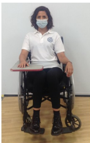
Figure 4. Positioning in a chair