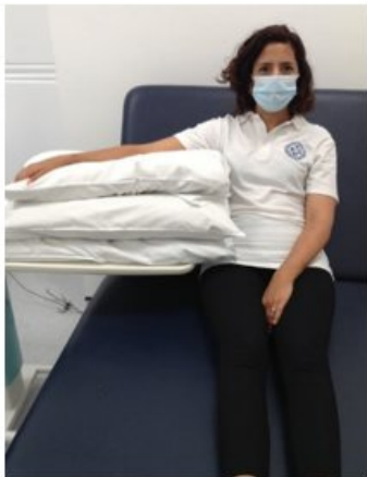
Figure 2. Positioning in bed