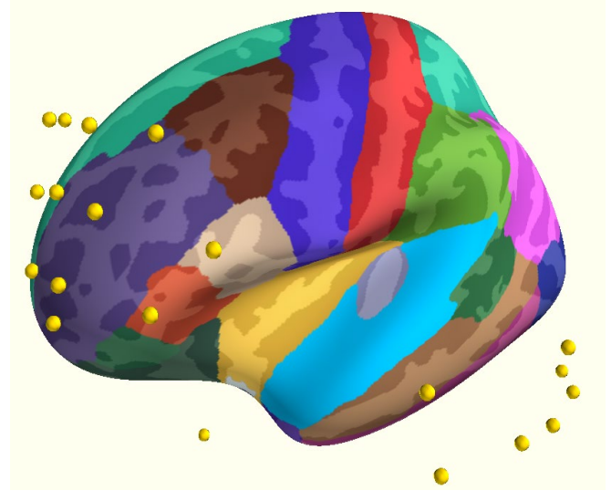
Figure 1: Subnetwork electrodes corresponding to auditory perception cortical areas

to the cortical regions, which are indeed responsible for audio processing in our brain. This observation does not change when we change the music stimuli (thus changing the tempo), which indicates the validity of the results.