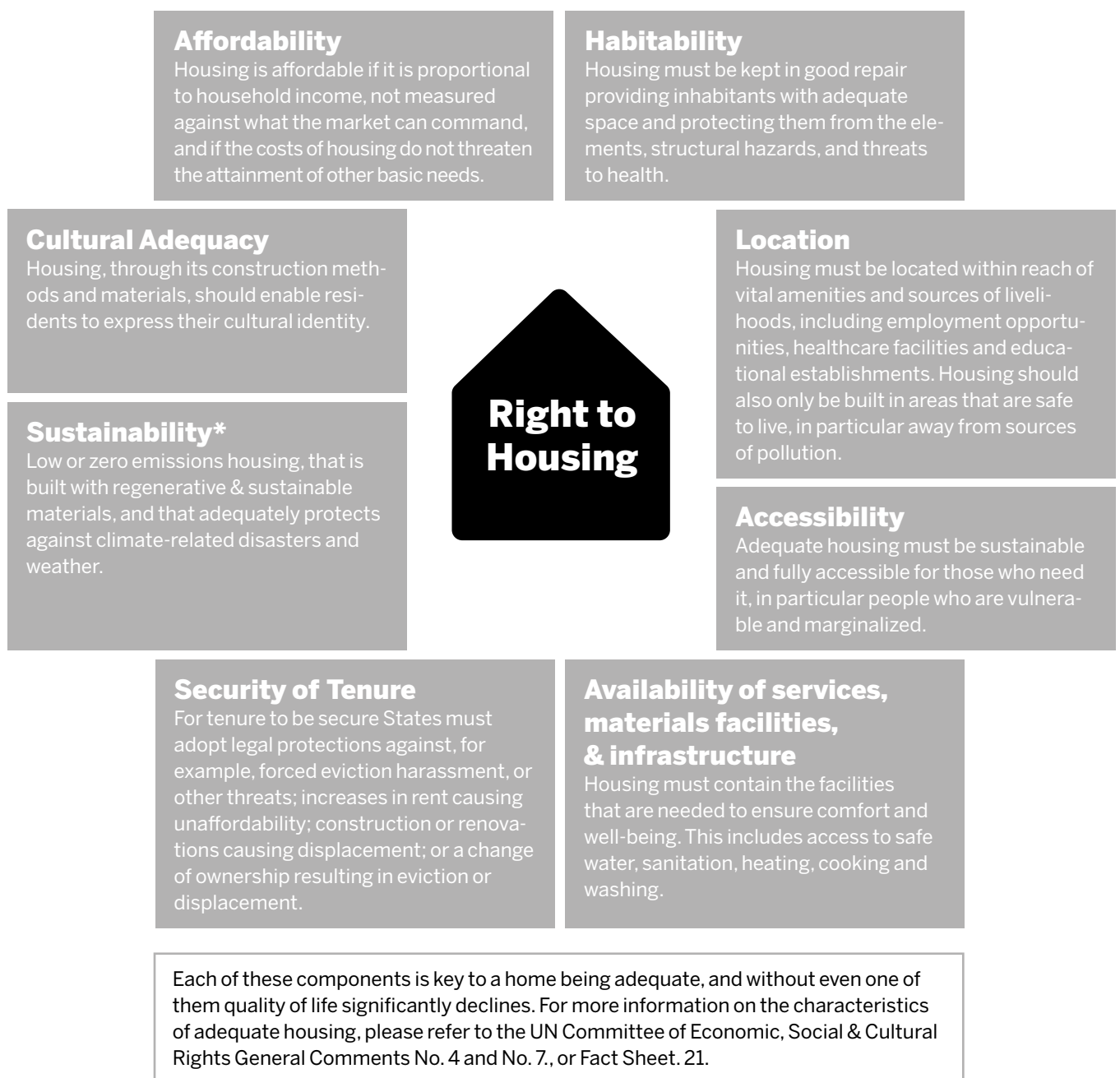
Figure 1. Characteristics of the right to housing

There is an international consensus that housing is a fundamental human right. It is found in the Universal Declaration of Human Rights (1948), in the International Covenant on Economic, Social and Cultural Rights, as well as other human rights treaties ratified by almost all national governments around the world. It is contained within Goal 11 of the Sustainable Development Goals (SDG), in the Paris Agreement, as well as in the New Urban Agenda. For housing to be considered adequate, it must have eight key characteristics, as seen in Figure 1.