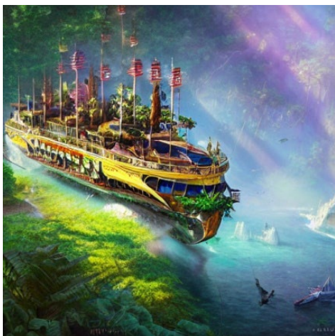
Figure 12 – AI generated fantasy cruiseliner

The fantasy Deep AI model was prompted to create images of cruise liners meeting the design requirements. A sample of the results can be seen in Figure 12 and Figure 13.