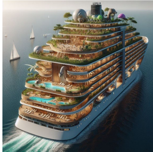
Figure 3 - AI Generated cruiser liner 2