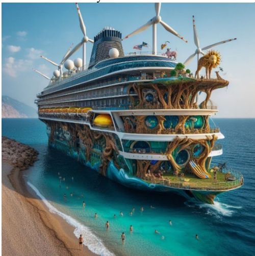
Figure 6 – Add wind propulsion

Additional prompts were then implemented to coerce the GENAI model to add different features. Similarly, four images per updated prompt were generated however only the best outcome each of the updates is being reproduced here in Figure 6 to Figure 9.