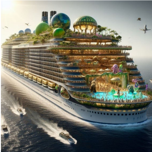
Figure 2 – AI Generated cruiser liner 1