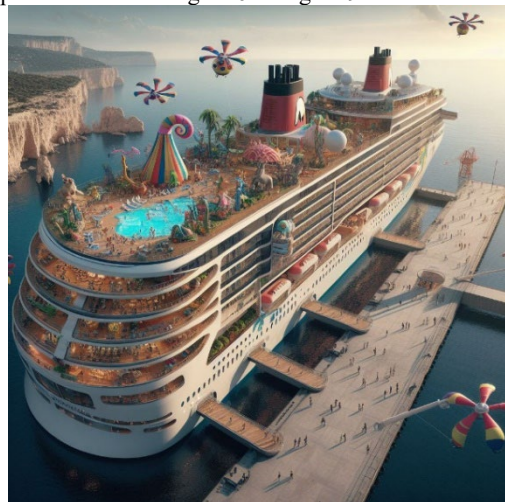
Figure 7 – Add Flettner Rotors