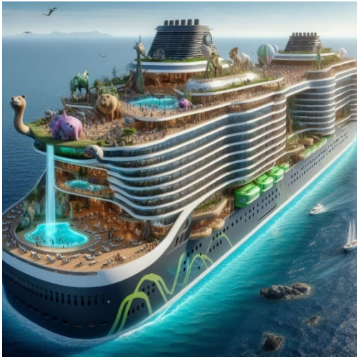
Figure 4 - AI Generated cruiser liner 3