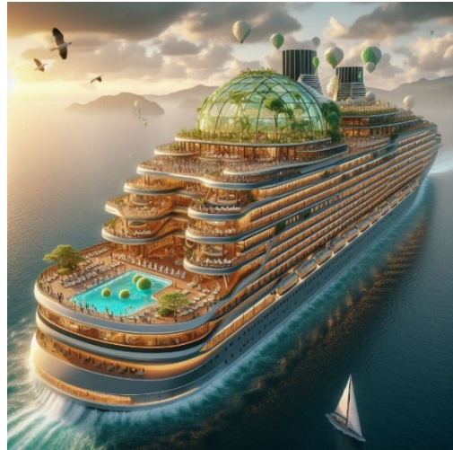
Figure 5 - AI Generated cruiser liner 4

Additional prompts were then implemented to coerce the GENAI model to add different features. Similarly, four images per updated prompt were generated however only the best outcome each of the updates is being reproduced here in Figure 6 to Figure 9.