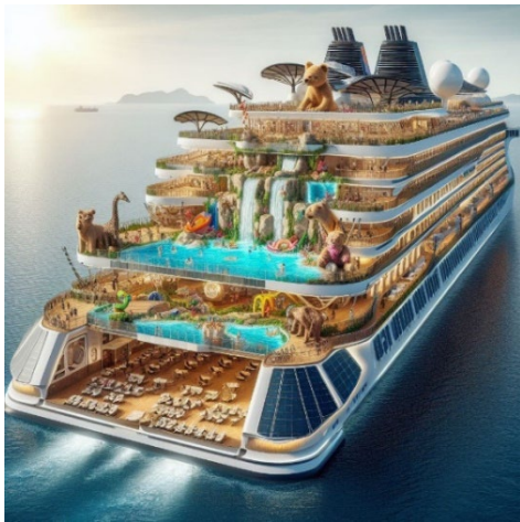
Figure 8- Add solar panels