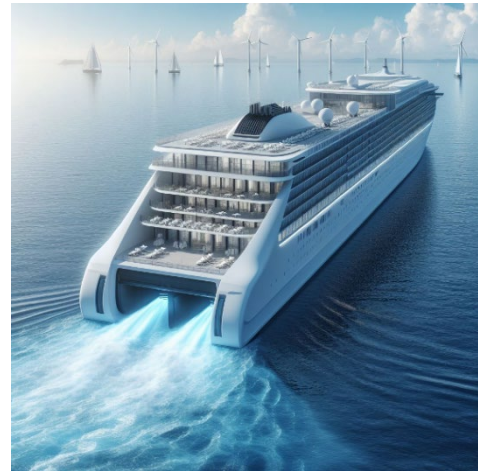
Figure 11 – AI Generated energy efficient Cruise liner 2