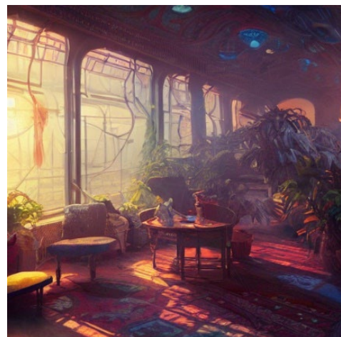
Figure 13 - Interior of fantasy cruise liner