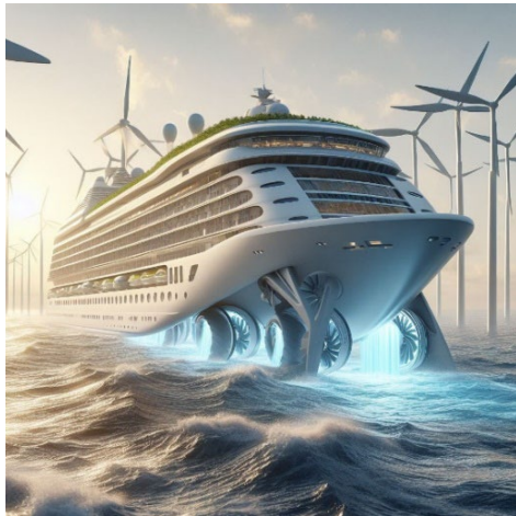
Figure 10 - AI Generated energy efficient Cruise liner 1

Additional results recorded from this explorative study can be found in Figure 10 and Figure 11.