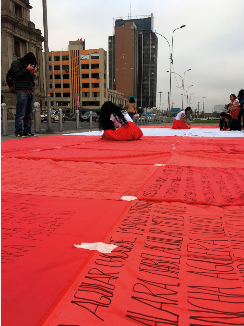
Figure 5.1 Activists writing the names of victims of forced sterilisations on pieces of red and white fabric sewn together to create a giant Peruvian flag (author's own).

abeyance, outlined in more detail in the introduction to this volume. The role of social media was key to this revitalisation. Contemporary feminist movements in Latin America are characterised by the use of Facebook, Twitter, Instagram and other social networks. However, analyses of activism and social media have tended to focus on their ability to