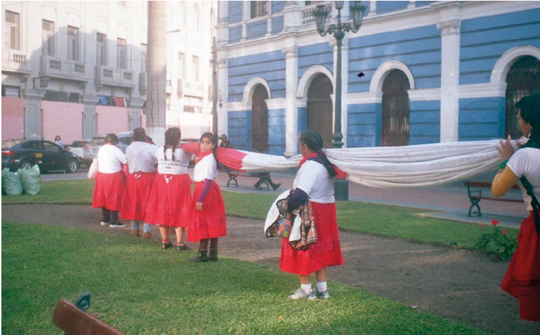
Figure 5.2 On their way to a protest, activists and members of the Lima Sterilisation Victim's Association hold a giant rolled-up Peruvian flag on their shoulders.

The Somos 2074 campaign initially emerged from independent feminist actions, before becoming a formalised campaign in 2016. The '2074' in its name refers to the number of the victims in the initial case brought by the state prosecutor. The official registry of victims (REVIESFO) now lists a total of 5,987 victims as of 2021, hence the addition of 'and many more' (Veliz 2016; Salas 2020). 2 This campaign works alongside the other groups that form part of the Grupo de Seguimiento a las Reparaciones a Víctimas de Esterilizaciones Forzadas (Monitoring Group for Reparations for Victims of Forced Sterilizations) and is also supported by the work of feminist NGO Estudio para la Defensa de los Derechos de la Mujer (Study for the Defence of Women's Rights; DEMUS). Somos 2074's activism includes legal work, research and lobbying, but its most visible activity takes place through performances and interventions that aim to put the issue of the sterilisations on the public agenda and continue campaigning for justice. Somos 2074 has become a key part of the wider Peruvian feminist movement.