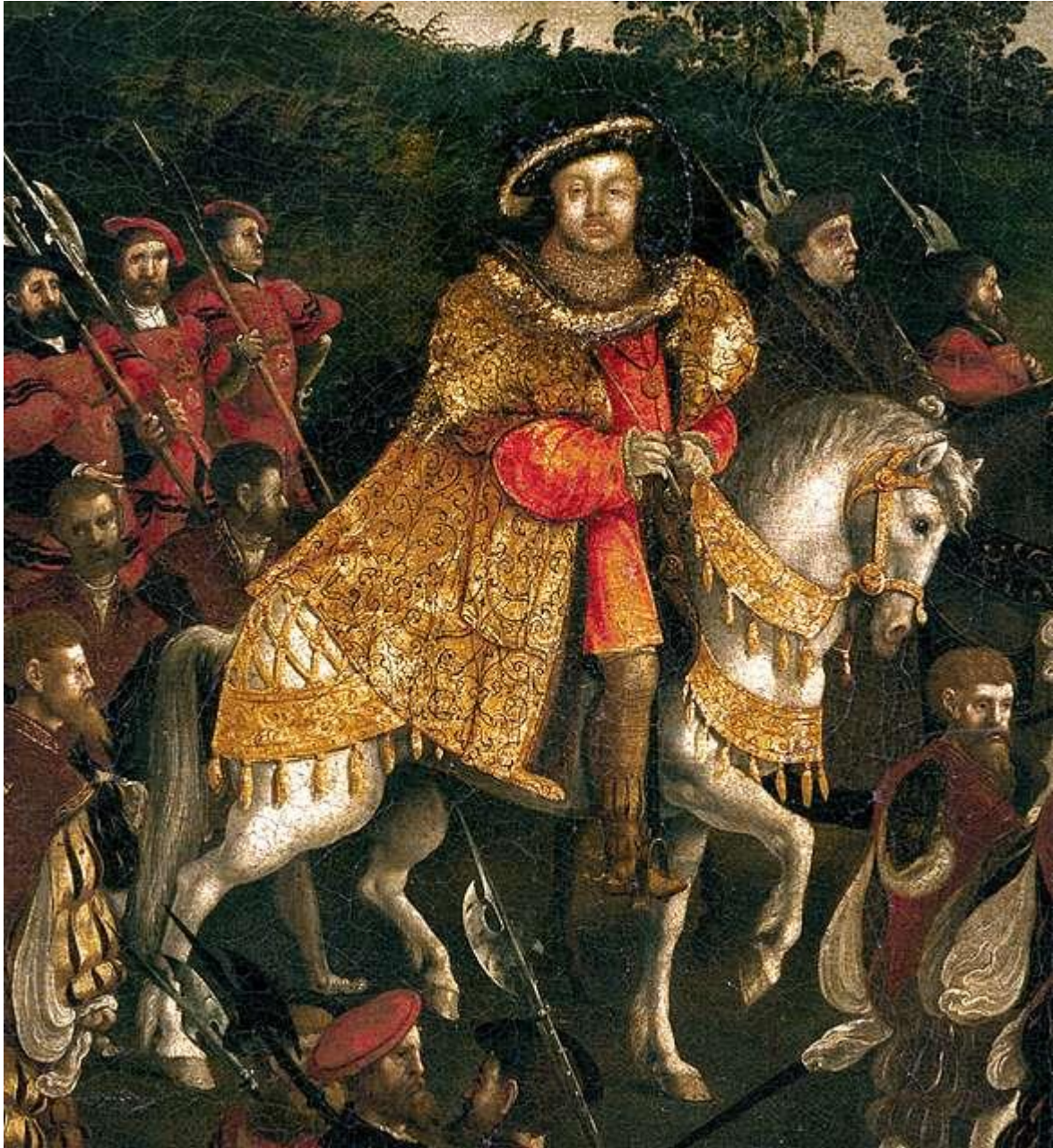
Detail of the Field of the Cloth of Gold 1545

The recent exhibition at the King's Gallery ( Holbein at the Tudor Court ) has re-awaked interest in the painting of the diplomatic meeting that took place between Henry VIII and Francis 1 near Calais on 7 June 1520. In this there is much period detail that can be drawn out of the 'Partying'.