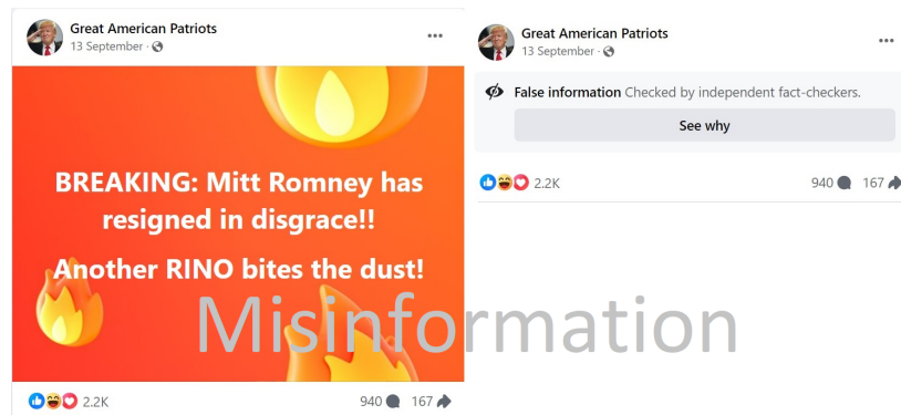
Figure 1: Example of a misinformation post by a partisan page and the fact-checked label on Facebook.

These examples helpfully raise our question of whether demonstrable falsehoods uttered by politicians deserve different treatment from demonstrable falsehoods uttered by ordinary citizens. 4