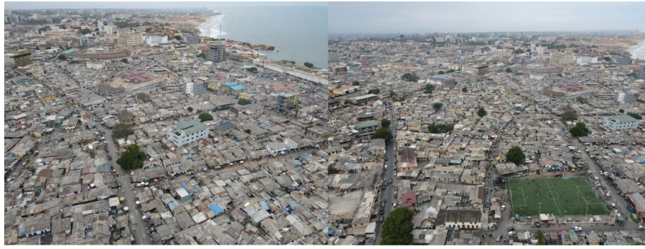
Figure 1. An aerial view of Ga Mashie.

Accra, and will use Global Positioning System (GPS) to map the commercial and built environment, including the locations of all food and drink outlets, health facilities and physical, religious, and social spaces.