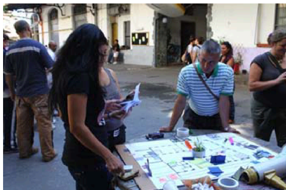
Figure 7. Fluviale, a moment from the workshop: discussing possibilities with the inhabitants.