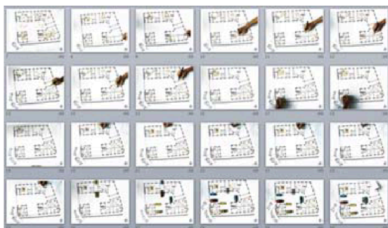
Figure 6. Fluviale, frames from the stop-motion movie on the history of the courtyard.

Inhabitants and participants had different reactions to the adopted design approach. The former feeling happy about being involved in the process and seeing themselves legitimated as the actual agent of change over their space; and the latter initially contesting it because of its being essentially retrospective, but then appreciating its potential to look differently at the past to envision possible shared future situations. Whatever idea was produced in six days, ultimately, our presence in the space became the first form of profanation against a sacralised practice of urban design and toward a reinvented, recalibrated, one. And the coming community of Porto, present but still unrealised (Agamben, 1993a), was enacted throughout the whole week, when the space had become open to the external – although maybe not to whatever being ( ibid. ) – and conflictive power relations within the community had been reshuffled with the aim of listening to everybody’s voice.