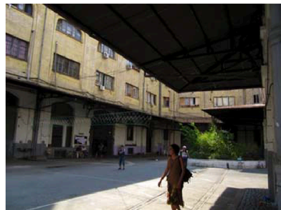
Figure 2. Fluviale, the courtyard.