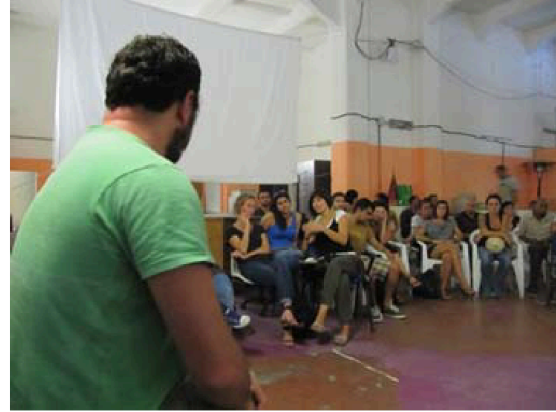
Figure 5. Fluviale, the assembly.