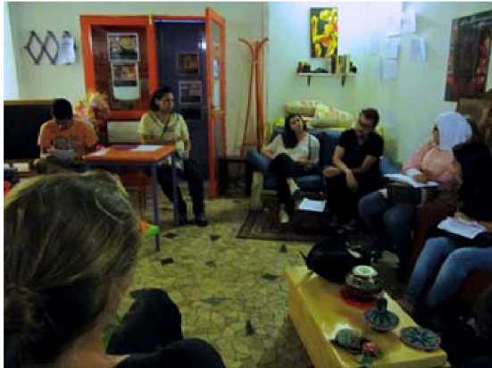
Figure 4. Fluviale, the tea room.