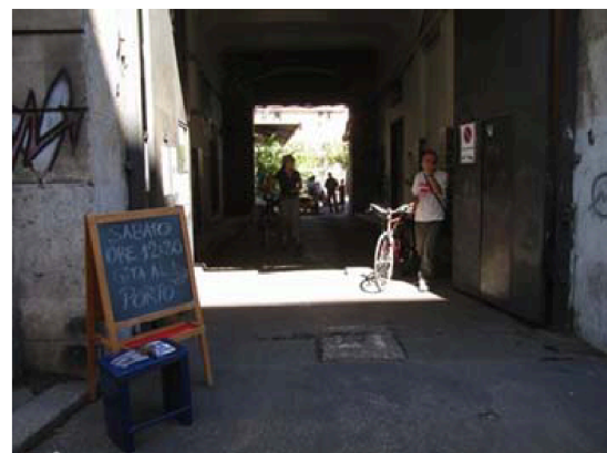
Figure 3. Fluviale, the open gate on the final day of the workshop.