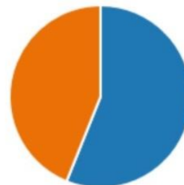
Figure 4- Survey question 8. 44% of students do not understand how SoRAs/ECs are applied to teamwork assignments

Question 10 used thematic analysis to evaluate suggestions made by students on how staff can better support students in teamwork contexts. Frequent themes related to more staff monitoring of teams, harsher penalties for non-contributing members, issues with space for teamwork: