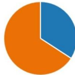
Figure 2- Survey questions 1 and 2: 1. 65% international student status. 2. 65% non-native English speakers

A study conducted by the University of Exeter in 2020 sought to understand international students' participation in teamwork and the main barriers that impact team cohesion and success (Straker, 2020). The main outcome suggested that English language competence was the main barrier. This corroborates the results gathered in this study, particularly in question 5 (figure 3) where 'Communication: language barrier' was the highest rated challenge faced by students working in teams (68%). This was closely followed by 'Partially-/non-engaged team members' (61%).