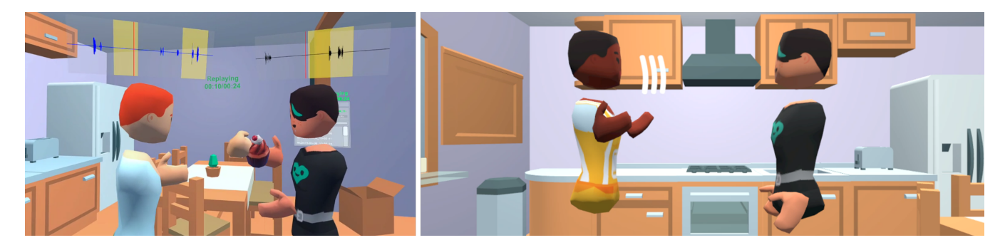
Figure 1: Left: Additions to the existing record and replay tool; audio indicators display each recorded avatar's audio waveform. The yellow highlights indicate when the avatars are grabbing the object. Right: One actor performing a dialogue with their previously recorded self in a virtual kitchen environment.

Anthony Steed a.steed@ucl.ac.uk University College London United Kingdom