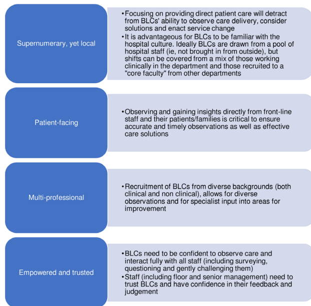
Figure 2 Maximising the value of the Bedside Learning Coordinator (BLC) role. Alongside operating within a broader learning system, we suggest that the above components are likely to be needed to get the full value from the BLC role.